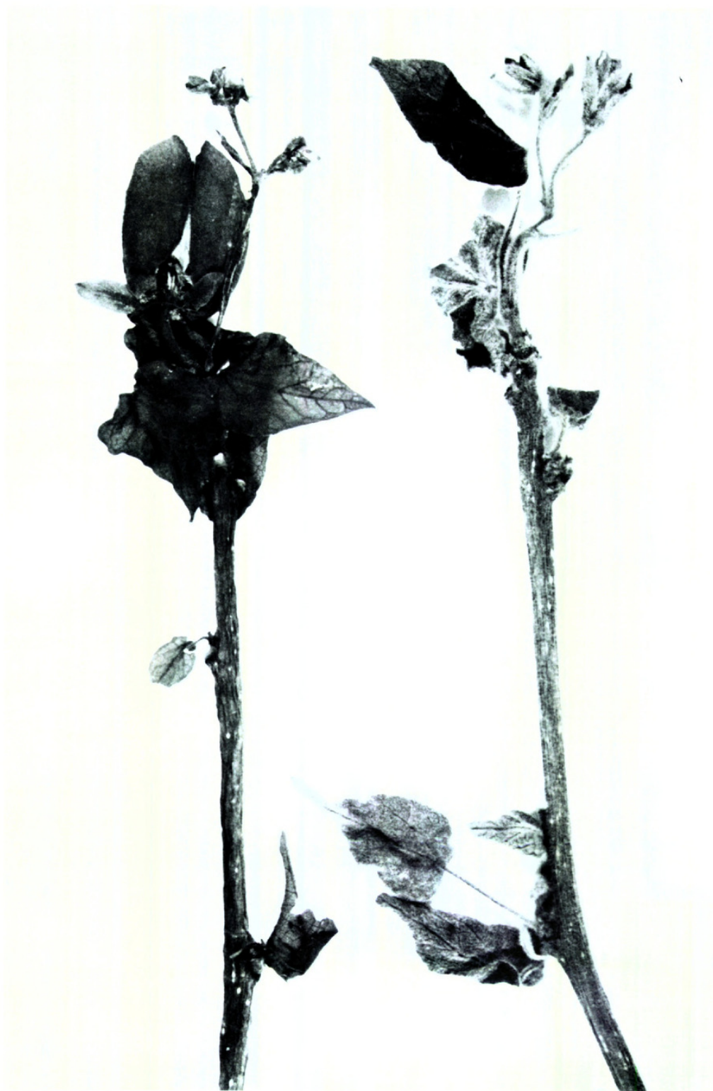
FIGURE 2. Photograph of type collection of Jatropha stevensii (Stevens 22902); left-hand glabrous branch with capsule and staminate flowers; right-hand pubescent branch with pistillate flowers.

(Nicaragua), and J. costaricensis Webster & Poveda (Guanacaste, Costa Rica). These species belong to two different subgenera and sections, J. podagrica in subg. Jatropha sect. Peltatae and J. stevensii and J. costaricensis in subg. Curcas sect.