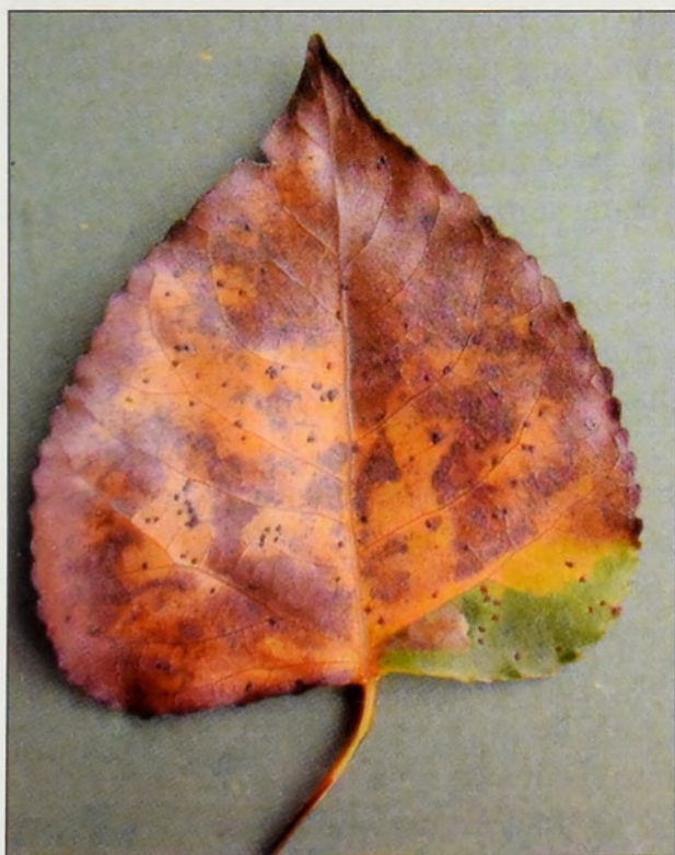
Fig. 2. Leaf-mine of E. hannoverella in P. × canadensis . Ipswich, 7 November 2003.