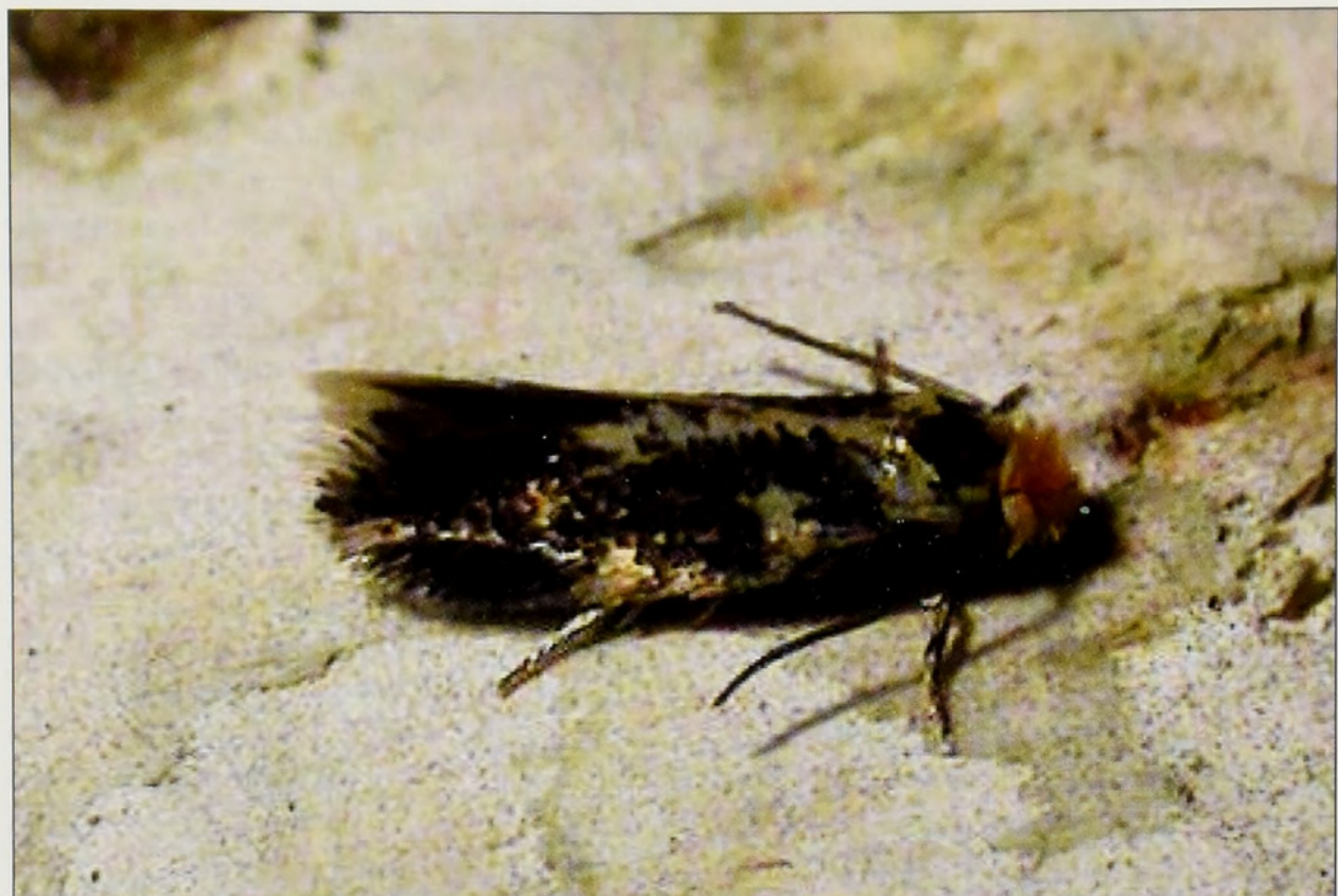
Fig. 1 Ectoedemia hannoverella (Glitz, 1872). Ipswich, 28 April 2004.