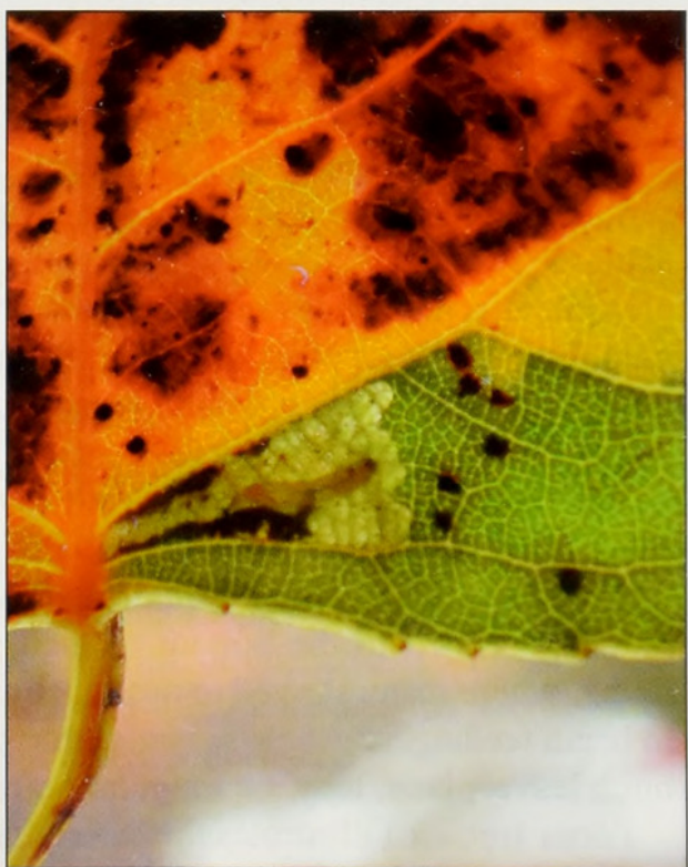
Fig. 3. Leaf-mine of E. hannoverella , showing detail of larva and parallel tracks of frass in blotch. Ipswich, 7 November 2003.