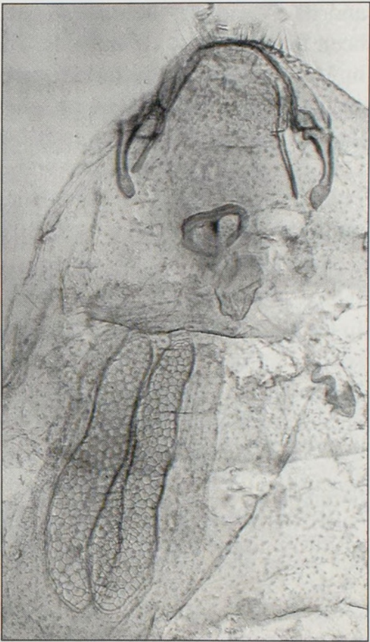
Fig. 3. Female genitalia of E. hannoverella (J. Clifton coll., slide number 165)