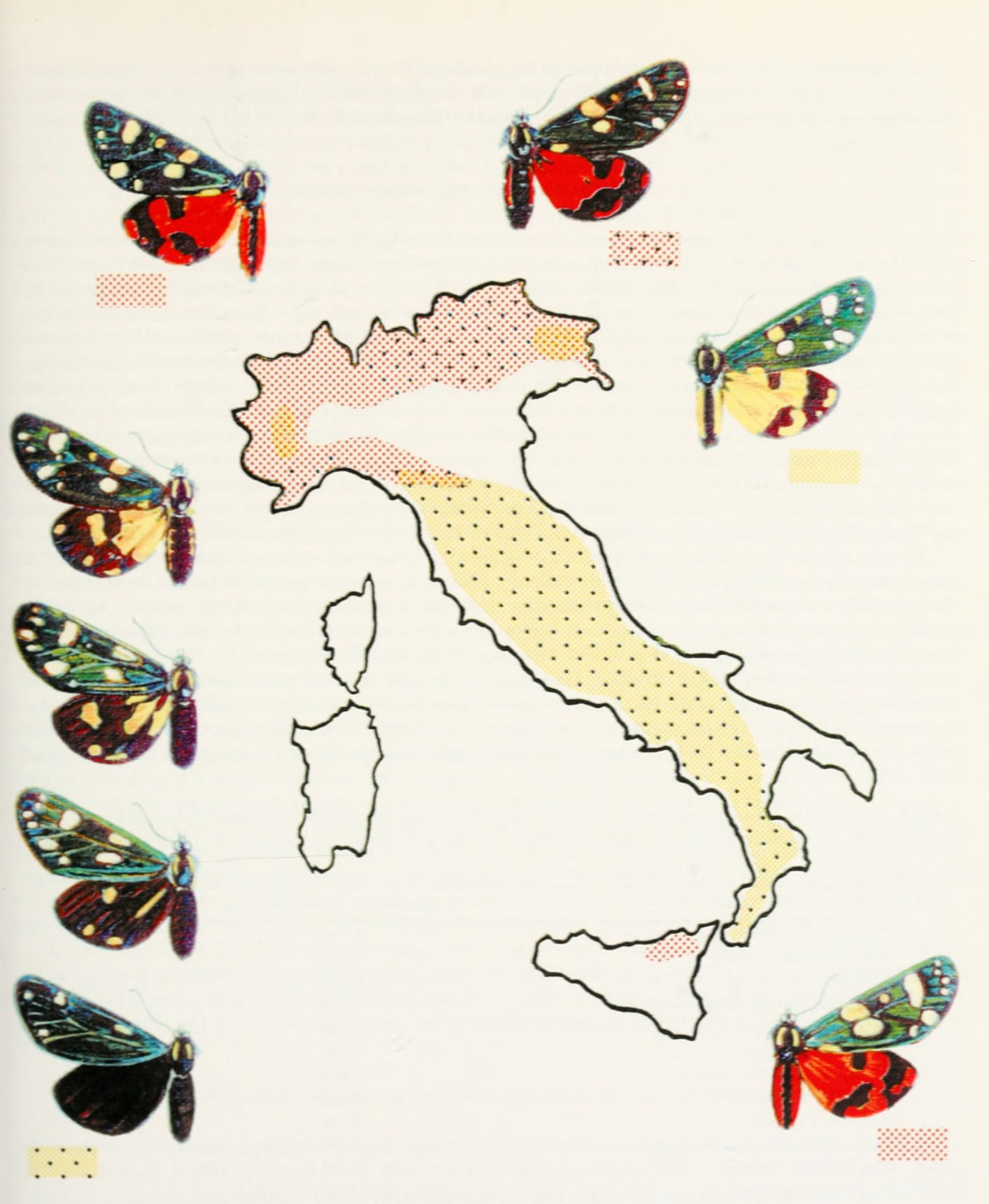
Fig. 1: Distribution of the colour polymorphism of Callimorpha dominula (LINNAEUS) in Italy.

composition of both mimicry rings between the southern Apennines and Sicily, a particular paucity of Y/ M species in the island will be evident (tab. 2).