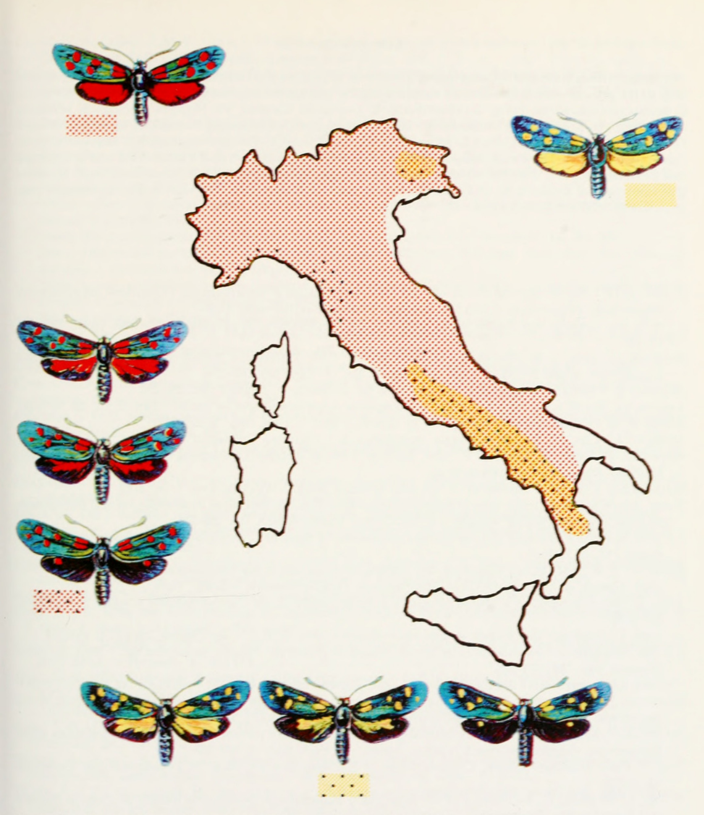
Fig. 3: Distribution of the colour polymorphism of Zygaena transalpina (ESPER) in Italy.

Avoiding recognition of any polytopic subspecies in a polytypic species would lead, for the sake of homogeneity, to not recognizing any subspecies in such a species and, by the same criterion, not recognizing subspecies in any species, unless it is definitively decided that taxonomy should not operate within a unitarian conceptual framework.