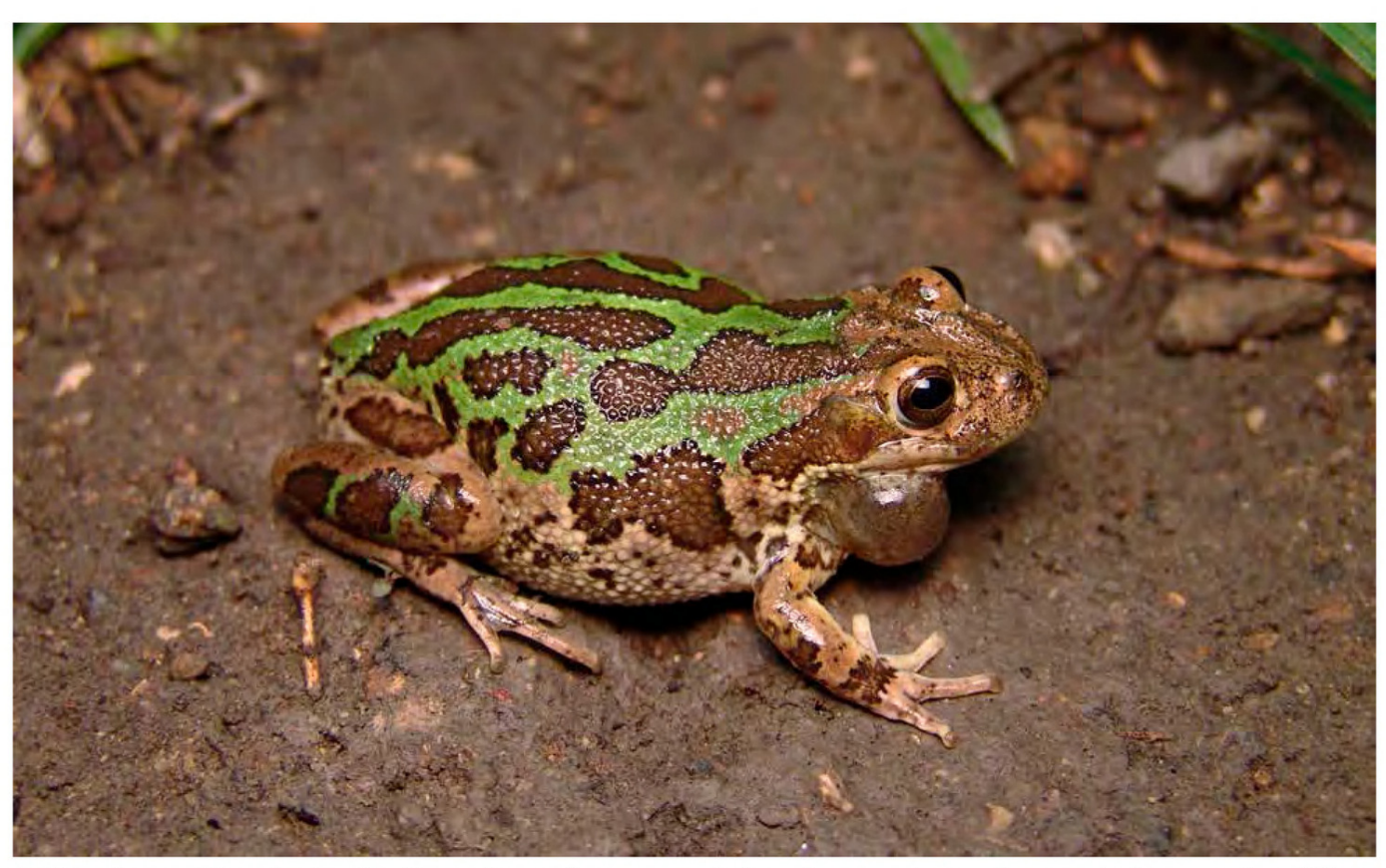
Smilisca dentata. The endemic upland burrowing treefrog occurs only in southwestern Aguascalientes and adjacent northern Jalisco. Its EVS has been assessed as 14, placing it at the lower end of the high vulnerability category, and its IUCN status as Endangered. This individual was found in the Municipality of Ixtlahuacán del Río, Jalisco.