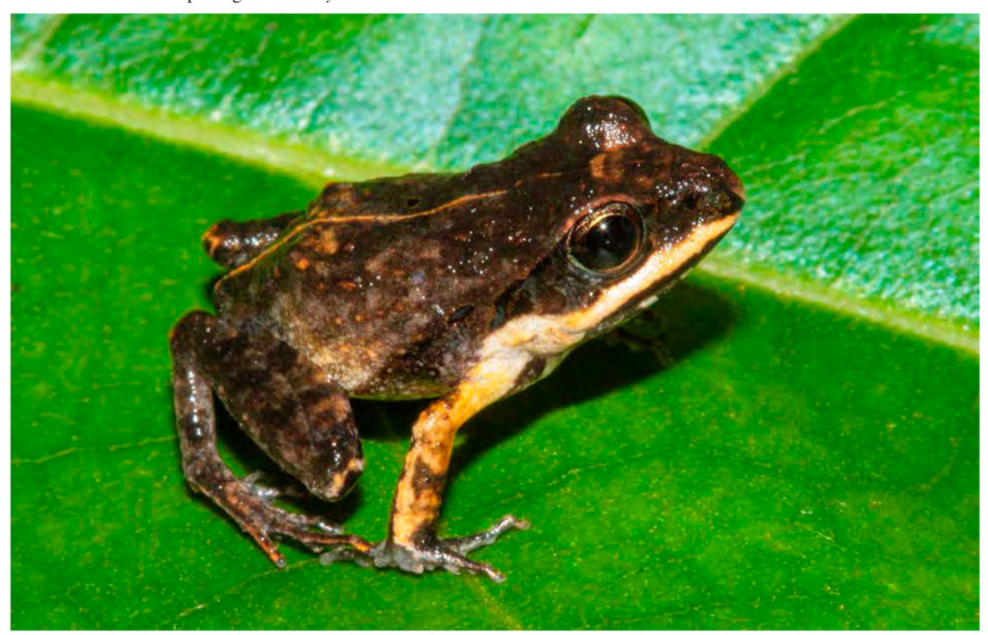
Craugastor hobartsmithi. The distribution of the endemic Smith's pygmy robber frog is along the southwestern portion of the Mexican Plateau, from Nayarit and Jalisco to Michoacán and the state of México. Its EVS has been determined as 15, placing it in the lower portion of the high vulnerability category, and its IUCN status as Endangered. This individual is from the Sierra de Manantlán in Jalisco.