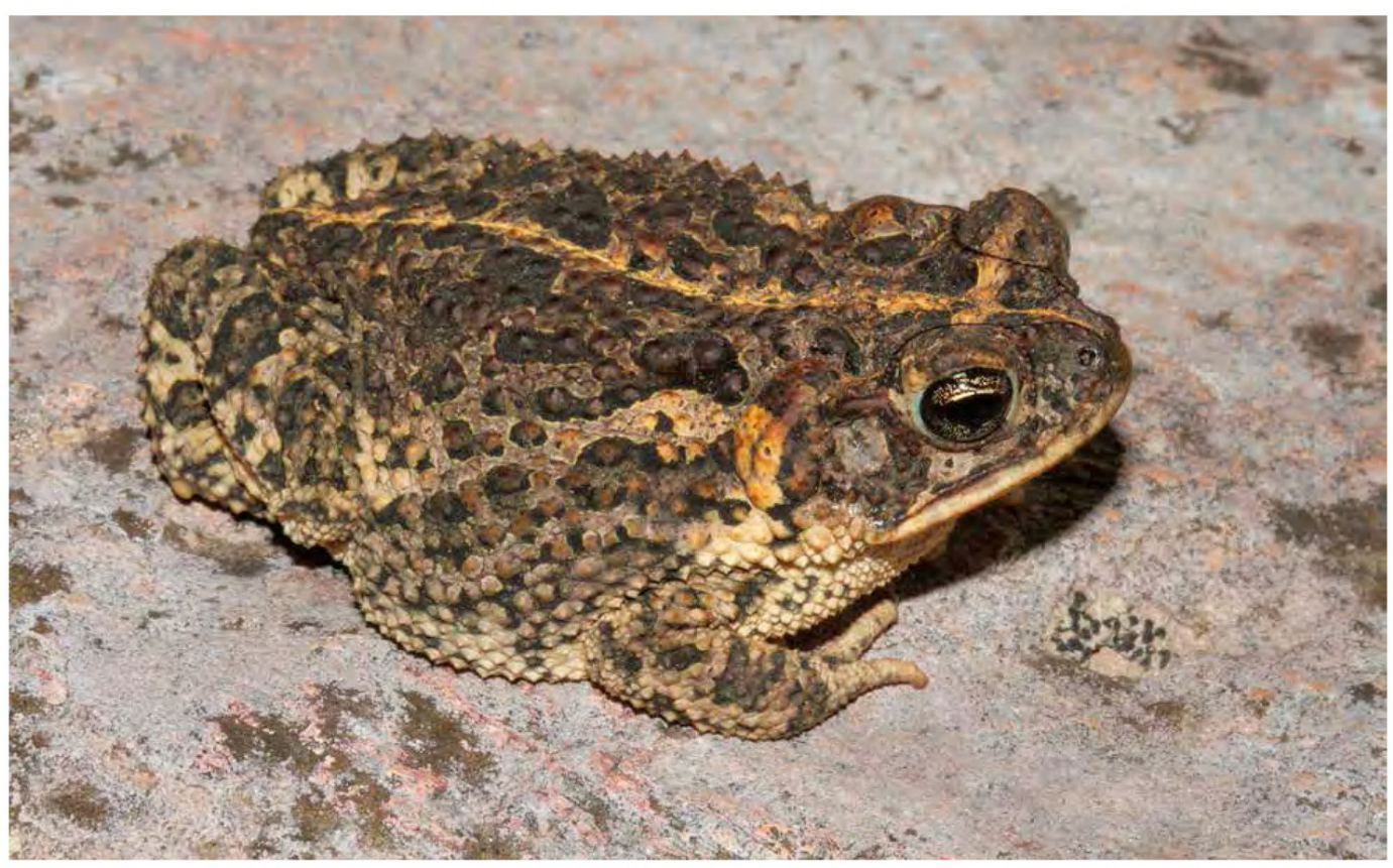
Incilius pisinnus . The Michoacán toad, a state endemic, is known only from the Tepalcatepec Depression. This toad's EVS has been assessed as 15, placing it in the lower portion of the high vulnerability category, and its IUCN status as Data Deficient. This individual came from Apatzingán.