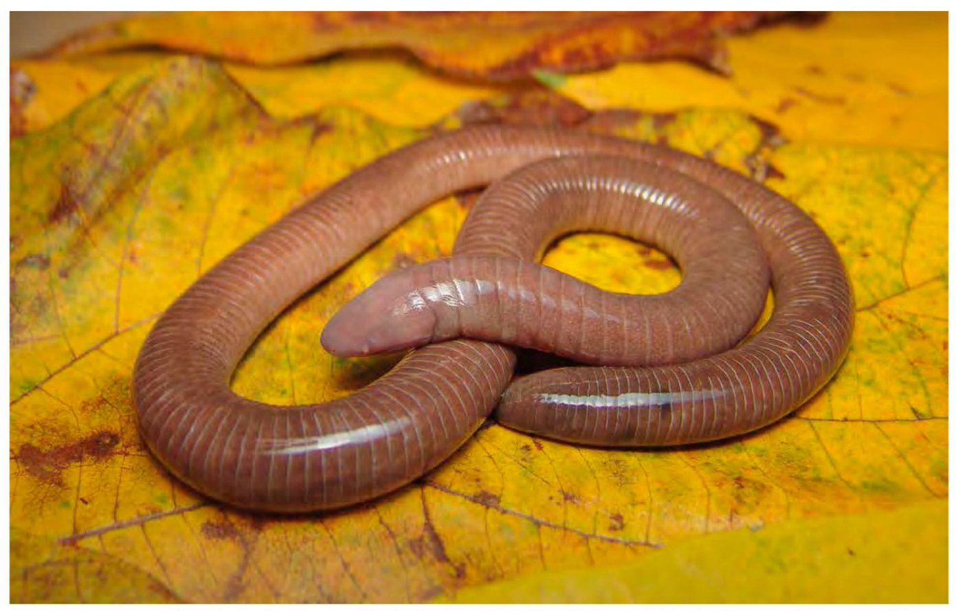
Dermophis oaxacae . The endemic Oaxacan caecilian is distributed in Colima, Jalisco, Michoacán, Guerrero, Oaxaca, and Chiapas. Its EVS has been calculated as 12, placing it in the middle portion of the medium vulnerability category, and its IUCN status as Data Deficient. This individual was found on the road at Ixtlahuacán, Colima.

species assessed as DD with those occupying the threat categories (CR, EN, and VU) to arrive at a total of 249 species (65.9% of the total amphibian fauna). The EVS range for these DD species (12–18) falls within that for the threat species as a whole (7–19) and the mean for all the four categories becomes 15.1, the same as that for the EN species alone. So, if the DD species can be considered "threat species in disguise," then close to two-thirds of the Mexican amphibian species would be considered under the threat of extinction.