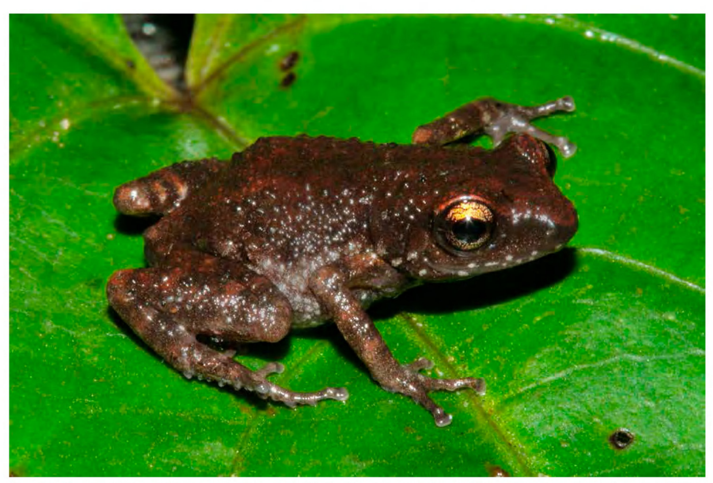
Eleutherodactylus modestus . The endemic blunt-toed chirping frog is known from Colima and southwestern Jalisco. Its EVS has been calculated at 16, placing it in the middle portion of the high vulnerability category, and its IUCN status as Vulnerable. This individual is from the Sierra de Manantlán in Jalisco.