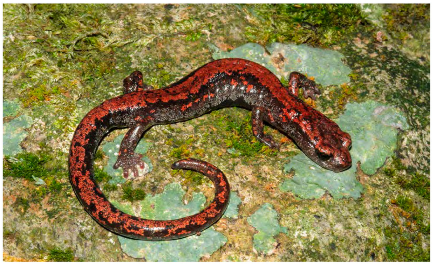
Pseudoeurycea longicauda. The endemic long-tailed false brook salamander is distributed in the Transverse Volcanic Axis of eastern Michoacán and adjacent areas in the state of México. Its EVS has been determined as 17, placing it in the middle of the high vulnerability category, and its IUCN status as Endangered. This individual came from Zitácuaro, Michoacán, near the border with the state of México.