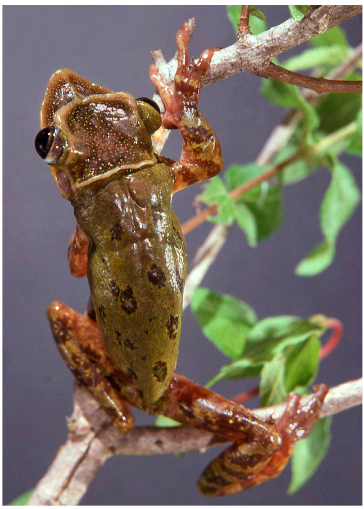
Triprion petasatus. The Yucatecan casque-headed treefrog is restricted primarily to the Yucatan Peninsula, occurring in the Mexican states of Yucatán, Campeche, and Quintana Roo, as well as in northern Guatemala and northern Belize. A disjunct population also has been recorded from Santa Elena, Departamento de Cortés, Honduras. Its EVS has been calculated as 10, placing it at the lower end of the medium vulnerability category, and its IUCN status is of Least Concern. Although this treefrog is broadly distributed in the Yucatan Peninsula, it usually is found only during the rainy season when males and females congregate around restricted bodies of water (solution pits, cenotes, and ephemeral ponds) on this flat limestone platform. During the dry season, these frogs retreat into tree holes and rock crevices, and sometimes use their head to plug the opening. This individual is from the state of Yucatán.