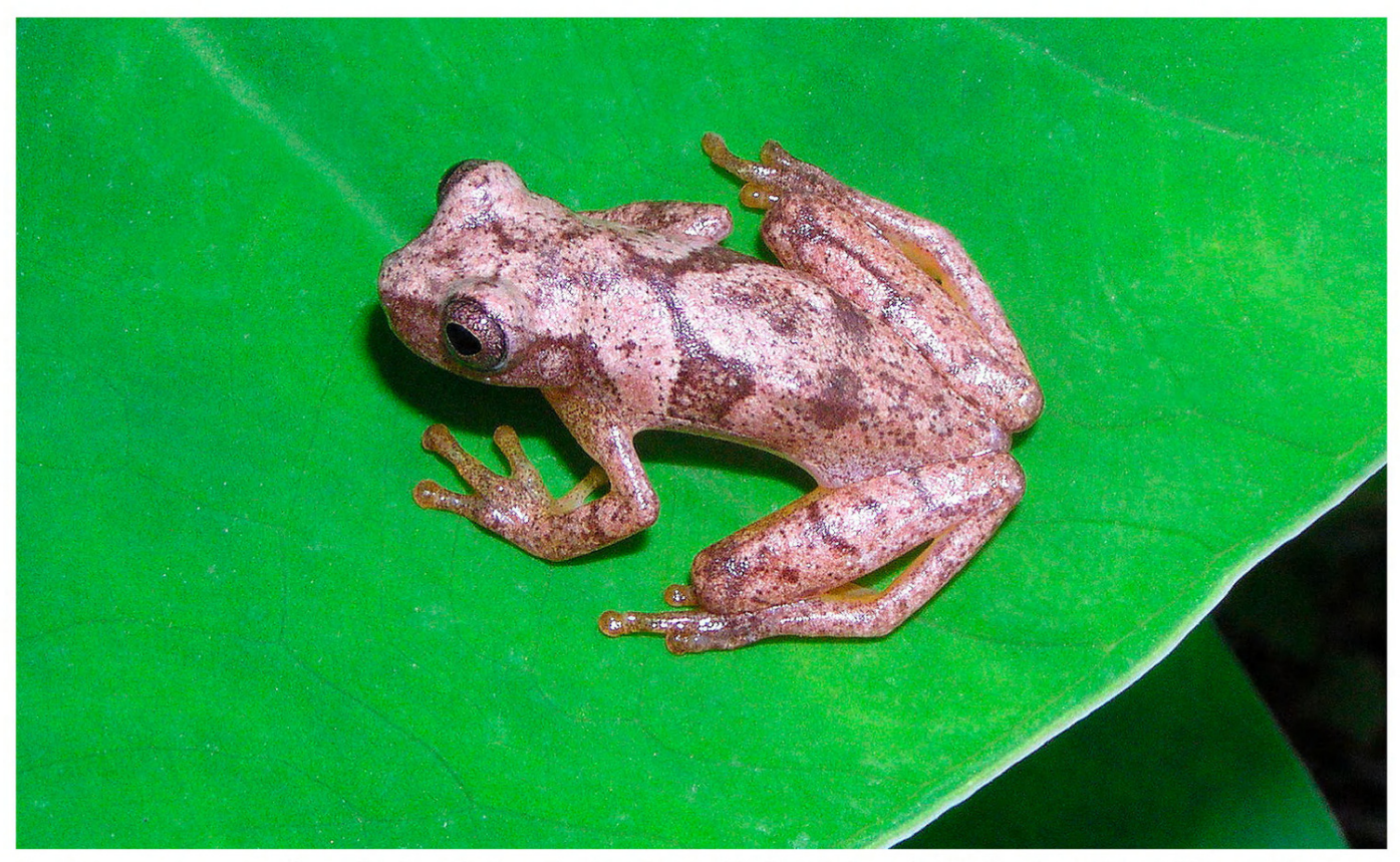
Dendropsophus sartori. The endemic Taylor's yellow treefrog is distributed along the Pacific slopes from Jalisco to Oaxaca. Its EVS has been determined as 14, at the lower end of the high vulnerability category, and its IUCN status as of Least Concern. This individual came from the Municipality of Minatitlán, Colima.