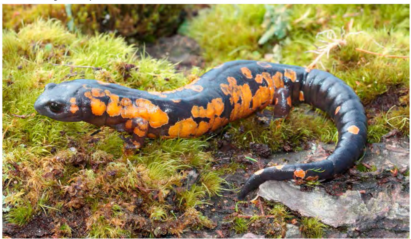
Bolitoglossa franklini. Franklin's salamander is distributed along Pacific slopes from southern Chiapas, Mexico, southeastward to south-central Guatemala. Its EVS has been determined as 14, placing it at the lower end of the high vulnerability category, and its IUCN status as Endangered. This individual came from Cerro Mototal, in the Municipality of Motozintla, Chiapas.