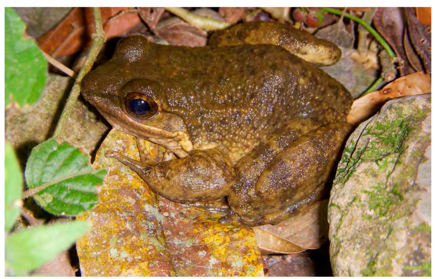
Lithobates johni. Moore's frog is an endemic anuran whose distribution is limited to southeastern San Luis Potosí, eastern Hidalgo, and northern Puebla. Its EVS has been assessed as 14, placing it at the lower end of the high vulnerability category, and its IUCN status as Endangered. This individual came from Río Claro, Municipality of Molango, Hidalgo.