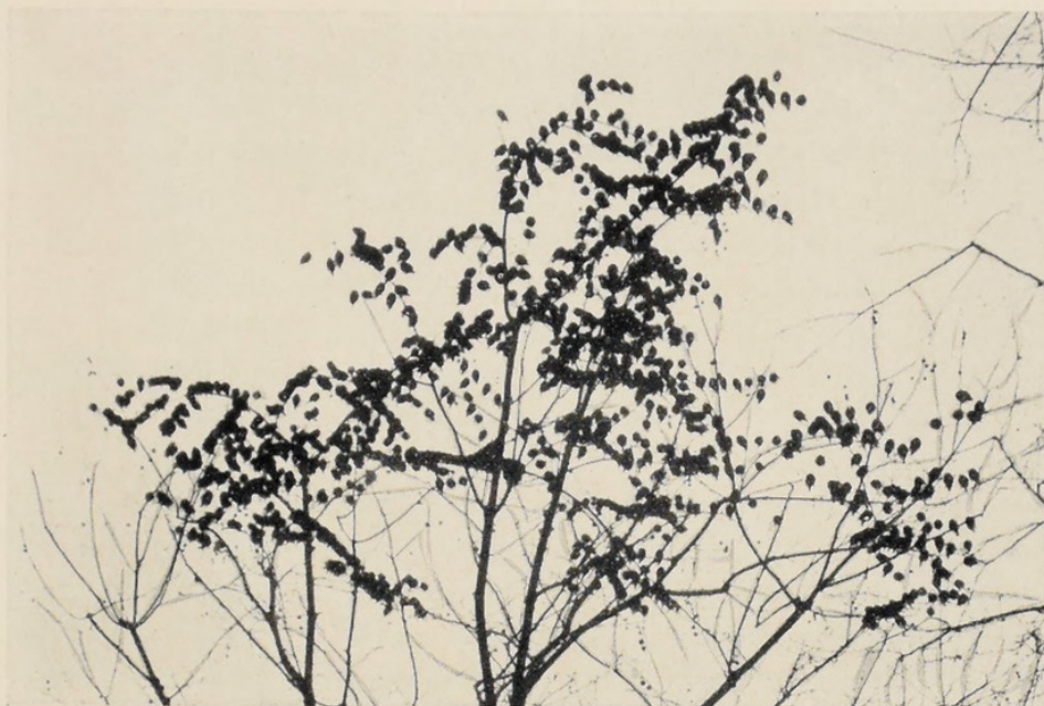
FIG. 15. A count made from the negative of this picture reveals about 1,000 Starlings in the top of this sycamore tree on Pennsylvania Avenue, Washington. The photograph was taken before sunrise.