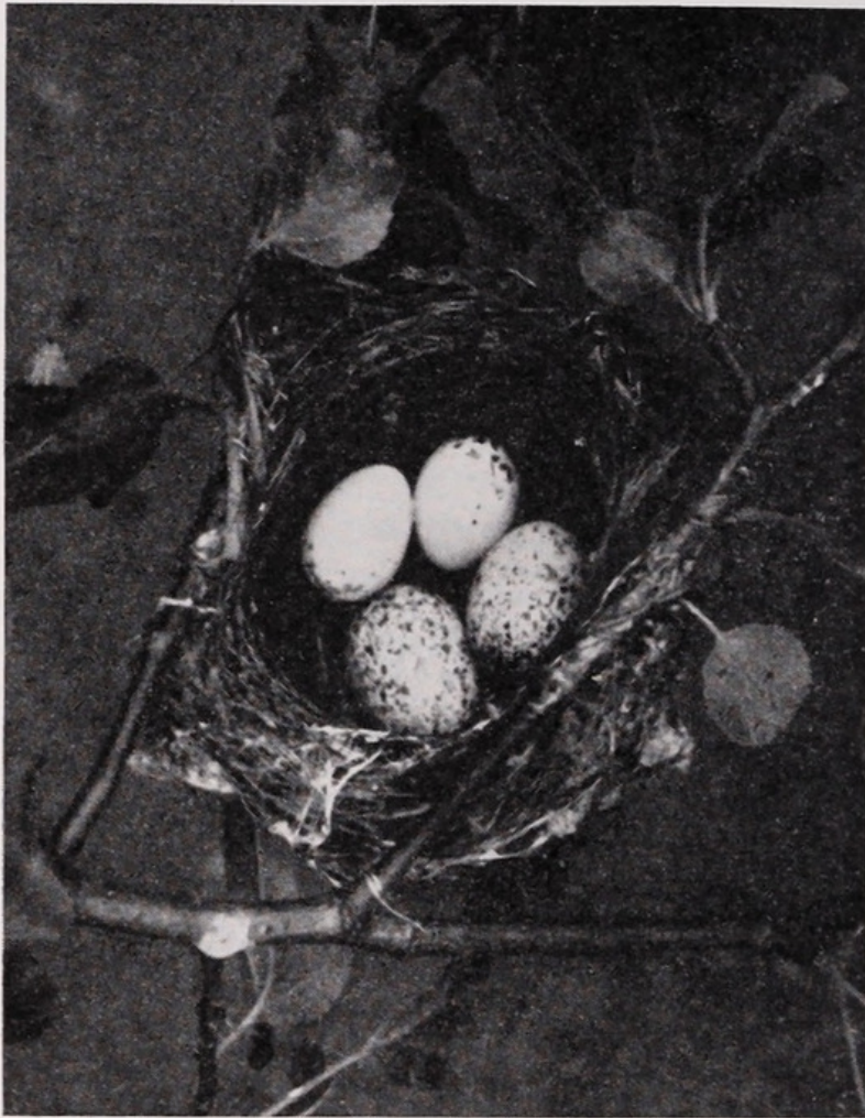
Figure 3. Nest No. 2 with two Vireo eggs and two Cowbird eggs. Inside diameter of nest, 4.5 cm.; outside diameter, 7 cm. The nest was two feet above the ground in an apple tree.

Bell's Vireo is commonly parasitized by the Cowbird (Friedmann, 1929: 237). Three of our five nests were deserted probably because of Cowbird activities; from the other two, young were fledged. Nice (1929)