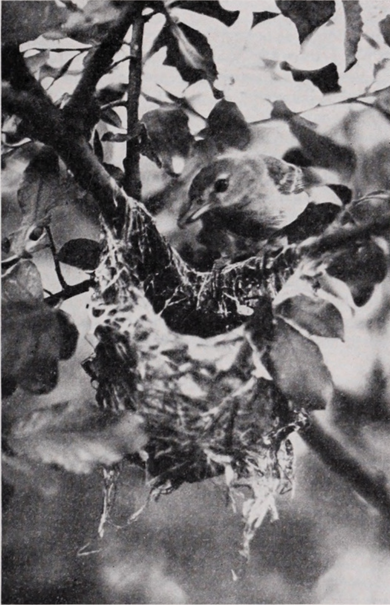
Figure 4. Adult Bell's Vireo at nest No. 4. The nest was 30 inches above the ground.

Bell's Vireo may desert when the Cowbird adds its eggs to the nest (Lantz, 1883). Other individuals of this species, as in our observations,