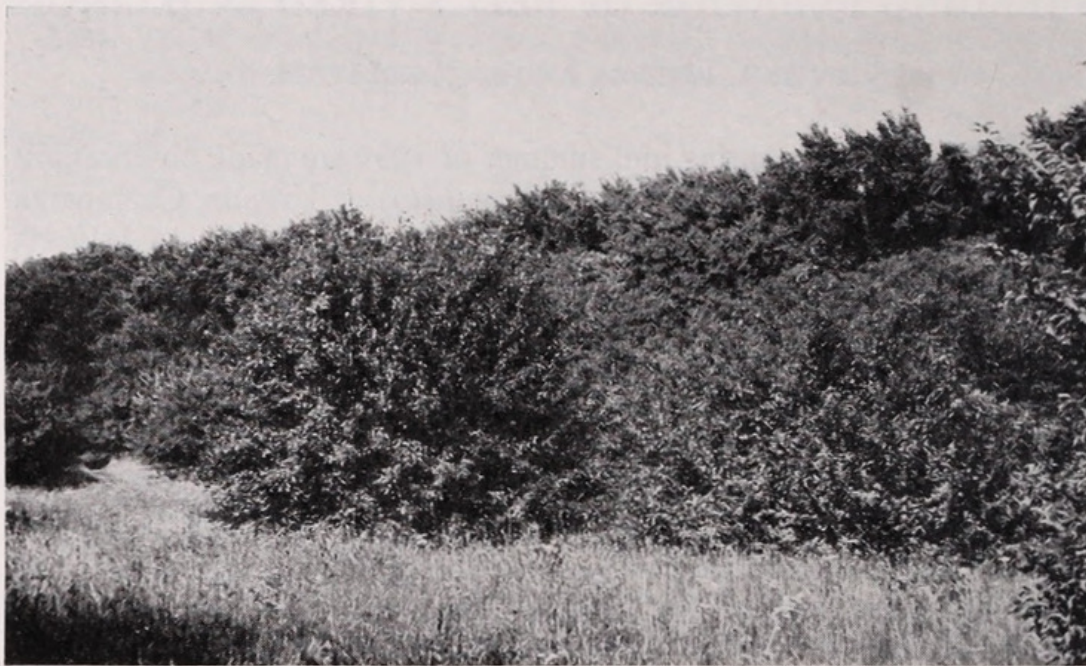
Figure 2. Scene in area A, facing northeast. The apple tree at left center contained nest 2. The higher trees of the forestry plot are seen in the background.

approximately 500 feet over open, tilled garden plots to the north of area A. The edge of a dense forestry plot connected the two areas (Figure 1), but no Bell's Vireos were noted along here during the period of breeding activities.