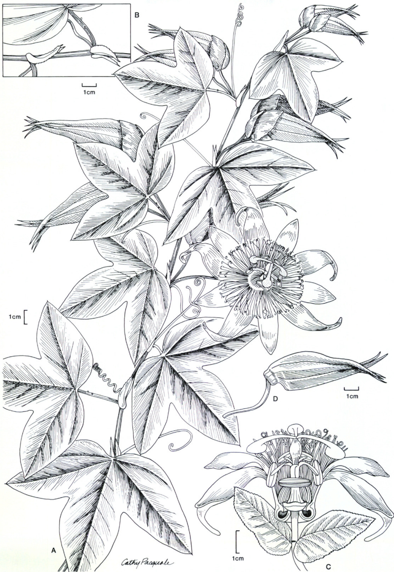
Figure 2. Passiflora exura C. Feuillet. —A. Flowering branch. —B. Stipules. —C. Flower (longitudinal section). —D. Flower bud (bracts removed). A, from photograph of Feuillet 4675; B–C, Feuillet 4721 (CAY); D, from photograph of Feuillet 4721.