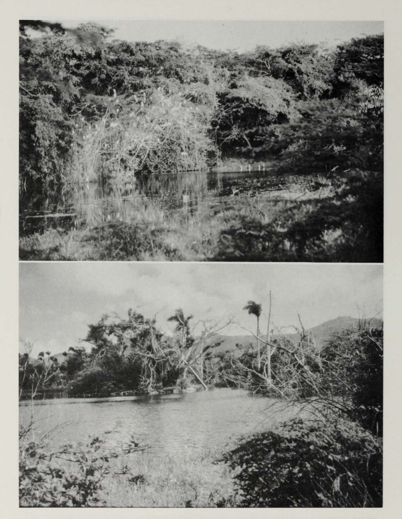
Fig. 3. Castle Burke Pond. Upper 1987 photo is of mature semi-evergreen forest vegetation around pond edge. Lower 1990 photo illustrates post-Hugo habitat.