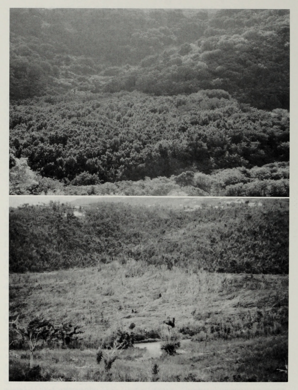
Fig. 1. Salt River Mangrove Swamp habitat. Upper 1987 photo illustrates mature mangrove forest. Lower 1990 photo illustrates post-Hugo conditions; most mangroves were flattened and the deciduous forest habitat on adjacent hillsides was damaged but recovered much faster.