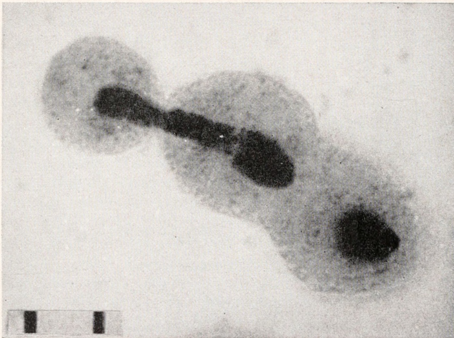
FIGURE 2. Photomicrograph of a Feulgen-stained cell during the first division after the heat treatment. The distance between the two lines on the scale is 10 \mu . Further explanation in the text.

In almost all cells examined only one SNA was found, but in some cases two or three SNA's could be observed in one cell. From the frequency with which