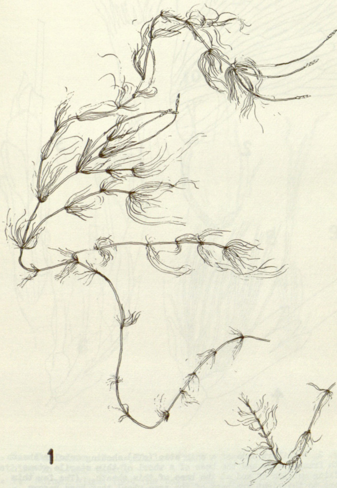
Fig. 1. Habit of Egleria fluctuans (slightly less than half natural size) showing branched main stem with whorls of thin sterile stems arising at nodes. The main stem branches terminate either with a group (simulating a whorl) of thin sterile stems and thick peduncles, or of successively crowded thin sterile stem whorls.