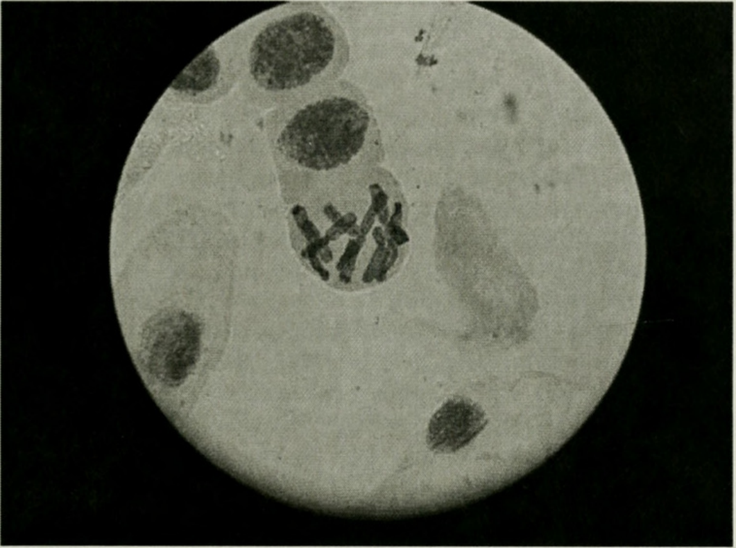
Figure 3. Chromosome division in Trillium oostingii .

Furthermore, chromosome counts revealed that the Wateree plant had a chromosome number of 2n=10 (Fig. 3), the same number as all known North American Trillium species (Hill, 2005), and is probably not a hybrid. [All known Trillium hybrid species are polyploids (Samejima and Samejima, 1962)].