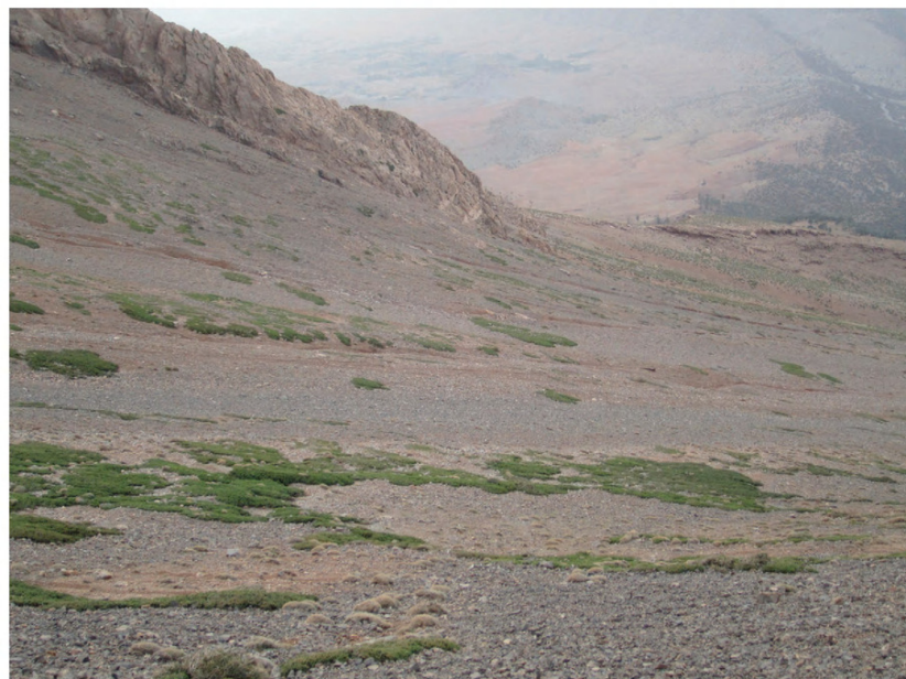
Figure 1. Habitat of J. communis in the high Atlas Mtns., Morocco (3000m). Notice the plants are very prostrate. This may be due to winter temperatures.

The purpose of this study was to compare data from nrDNA and four cpDNA regions of J. communis from Morocco with other members of Juniperus sect. Juniperus from the eastern hemisphere to determine the taxonomic affinity of J. communis from Morocco.