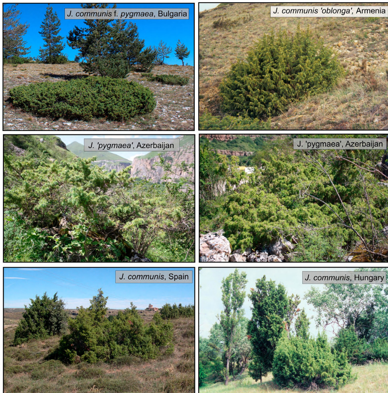
Figure 4. Plant habits of J communis f. pygmaea , Bulgaria, J. communis 'oblonga', Armenia compared to J. 'pygmaea' , Azerbaijan and J. communis , Spain and Hungary.