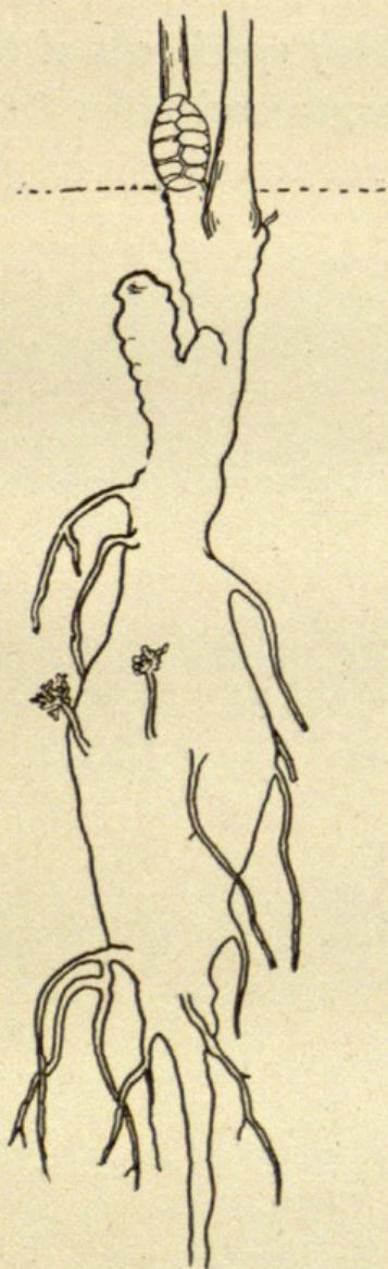
FIG. 3.— Bowenia spectabilis : a somewhat diagrammatic sketch of the stem of an ovulate plant; the portion shown is somewhat less than 1 m. in length; the dotted line is the ground line.

The most striking difference between the species and the variety is in the stem, which is subterranean in both. In the species the stem is somewhat carrot-shaped, with one or two, sometimes four or five, slender branches at the top (fig. 3). These slender branches bear all the leaves and cones.