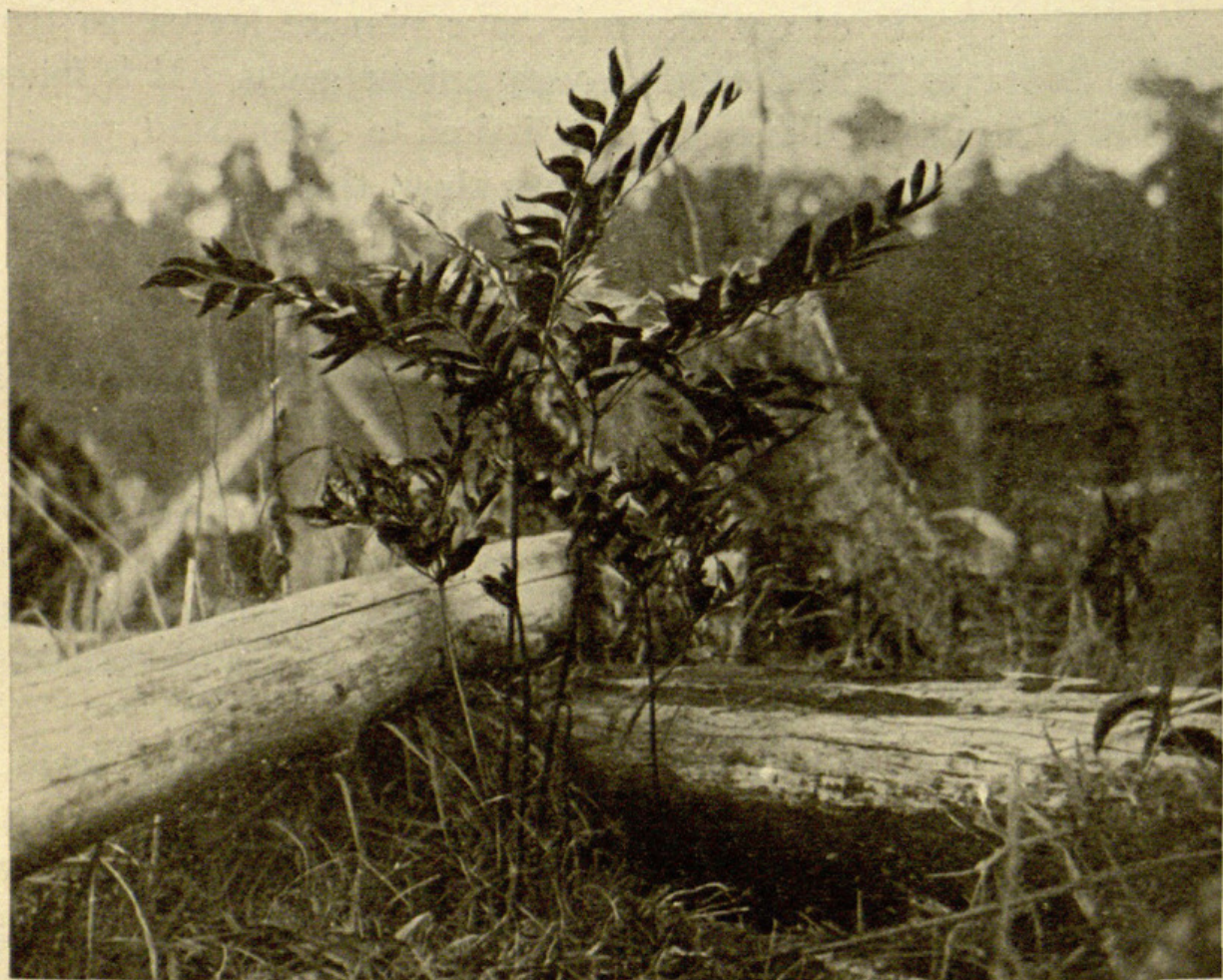
FIG. 1.— Bowenia spectabilis at Babinda, Australia: about 1 m. in height

Whether the margin of a leaflet is entire or serrate or spinulose may be trivial in some cases and important in others, even within the range of a single family. Dioon spinulosum was for a long time characterized almost solely by the spinulose leaflets, but the character is so constant that determinations based only upon this feature are quite safe. On the other hand, the leaflets of the African Stangeria paradoxa may show the entire or the serrate character on the same plant or even on the same leaf. In the Botanical