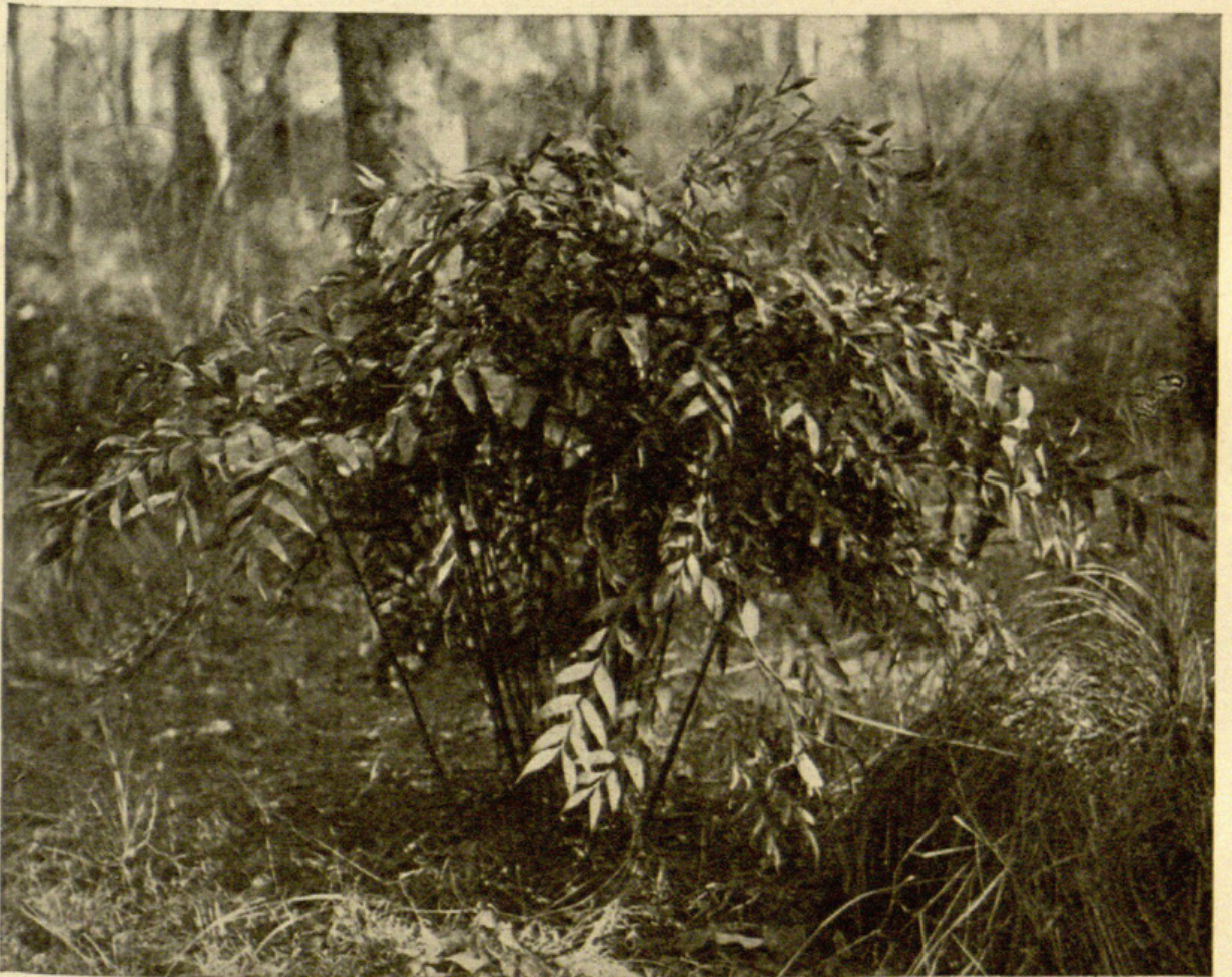
FIG. 2.— Bowenia serrulata at Byfield, Australia: about 1.3 m. in height

As found in nature, the species and the variety are noticeably different, the latter having a greater display of foliage (figs. 1 and 2). The species is most abundant in open places and clearings, while the variety is most abundant in the bush. Many specimens of the species in shaded places along streams are larger and taller than forms growing in the open, the leaves sometimes reaching a length