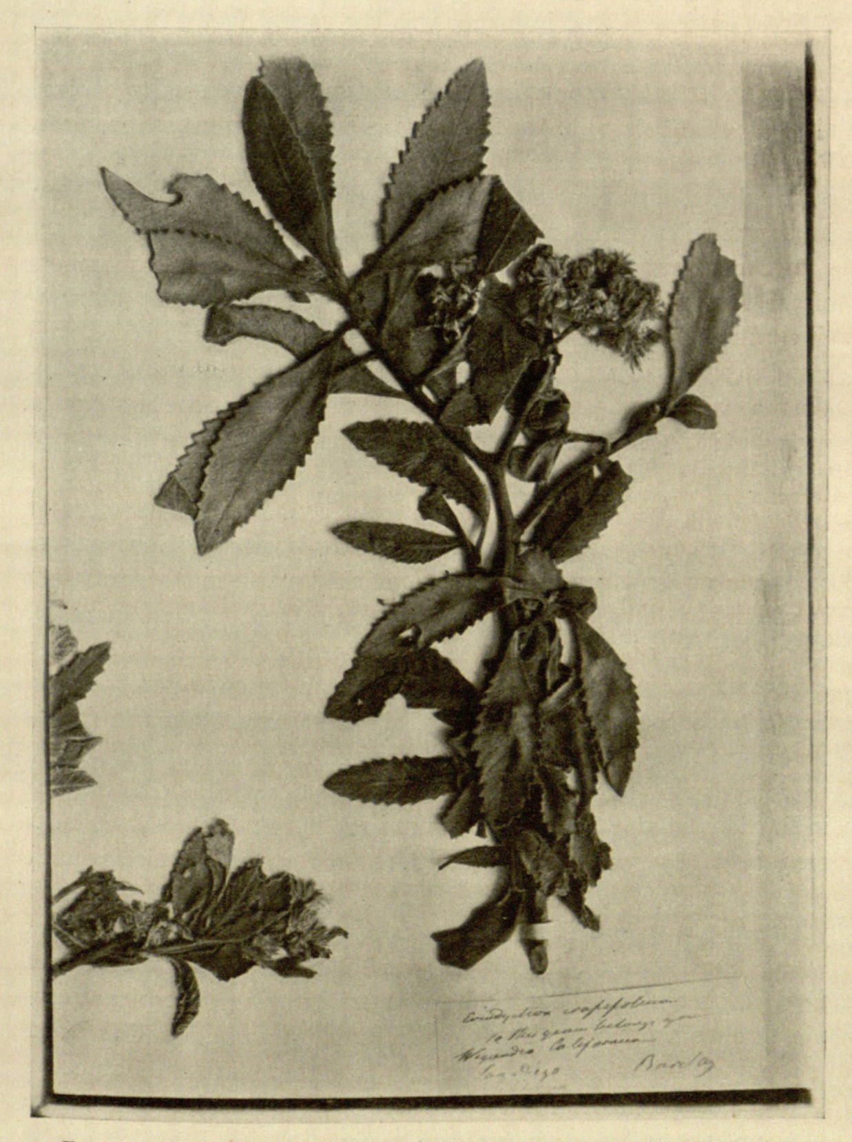
FIG. 1.— Eriodictyon crassifolium Benth.: type specimen in the Bentham Herbarium at Kew Gardens.

sprung from a common stock is also evident, for, as we shall show, there are forms still existing that comprise an almost unbroken series from the glutinous to the tomentose type.