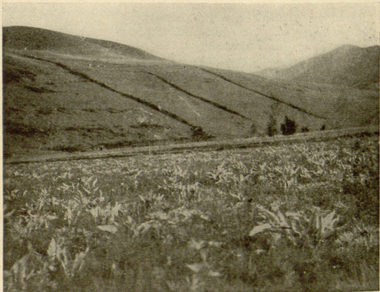
FIG. 1.—Field of Balsamorhiza sagittata in vicinity of Missoula, Montana, in May 1916.

A survey of field plants was made during May 1916. Plots covering areas 300 ft. square were studied, and the number of root-stocks counted and the seedlings in those areas listed. For two such plots about 800 plants were found, equally divided between the two plots. This number comprised all plants of B. sagittata of all sizes and ages within the plots. An accurate idea of the distribution of the plants is seen in text fig. 1. Areas 4 ft. in radius were