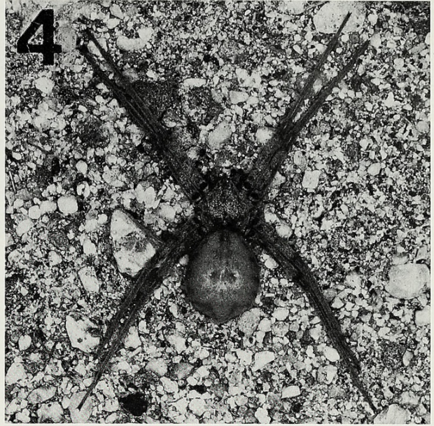
Figures 3, 4.—Postures of Homalonychus theologus . 3. Characteristic resting posture of Homalonychus with legs held flat and spread equidistant from one another. This penultimate male molted and was not placed back on sand. Hence, it shows its natural coloration without sand trapped amongst hairs; 4. Posture of a female H. theologus with rigid body and paired legs, possibly a defense mechanism.

which trap small sand grains (except in mature males) (Roth 1984). Immobility is a common general defense among animals (Cott 1940). Cloudsley-Thompson (1995) mentions death-feigning (thanatosis) in an exhaustive review of spider defensive behaviors; however, no behavior such as we have seen in H. theologus is mentioned. Additionally, thanatosis in spiders usually involves holding the legs tucked in close to the body. The rearrangement of the legs in H. theologus is somewhat puzzling as two legs held together would seem to increase the spider's conspicuousness, and hence belie its cryptic nature. Possibly, this leg orientation provides a novel image to a predator accustomed to eating spiders. Predators are known to avoid novel stimuli (Cott 1940) although we doubt that predators will care whether its prey have "4" or 8 legs. We would like to offer one additional speculative hypothesis. Because H. theologus is both nocturnal and a desert dweller, possibly the immobility in concert with paired-leg posture mimics the appearance of detached spines of dead cactus which could be an effective defense in the desert at night when visibility is poor.