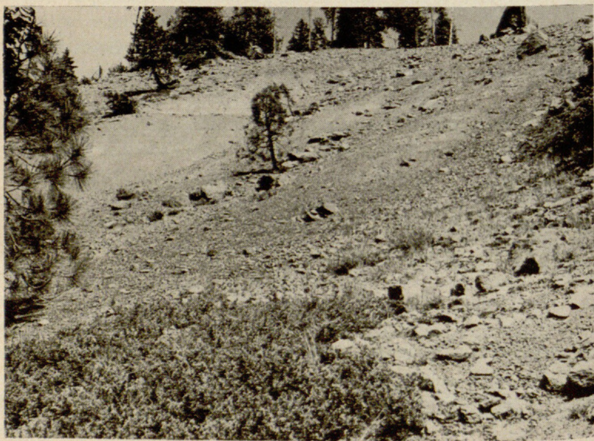
FIGURE 2. TYPICAL SERPENTINE-BARREN SLOPE IN THE CONIFEROUS FOREST REGION OF WENATCHEE MTS. ALL THREE "ULTRAMAFIC" FERNS ARE FOUND ON THIS SLOPE.

The vegetation on the Twin Sisters dunite contrasts strikingly with that on the adjacent non-ferromagnesian parent materials. The luxuriance of the Humid Transition forest abruptly gives way to stunted Douglas fir, lodgepole pine, western white pine, and shrubby Juniperus communis . The insular ultramafics also support conifers, largely Douglas fir, beach pine, and Juniperus scopulorum .