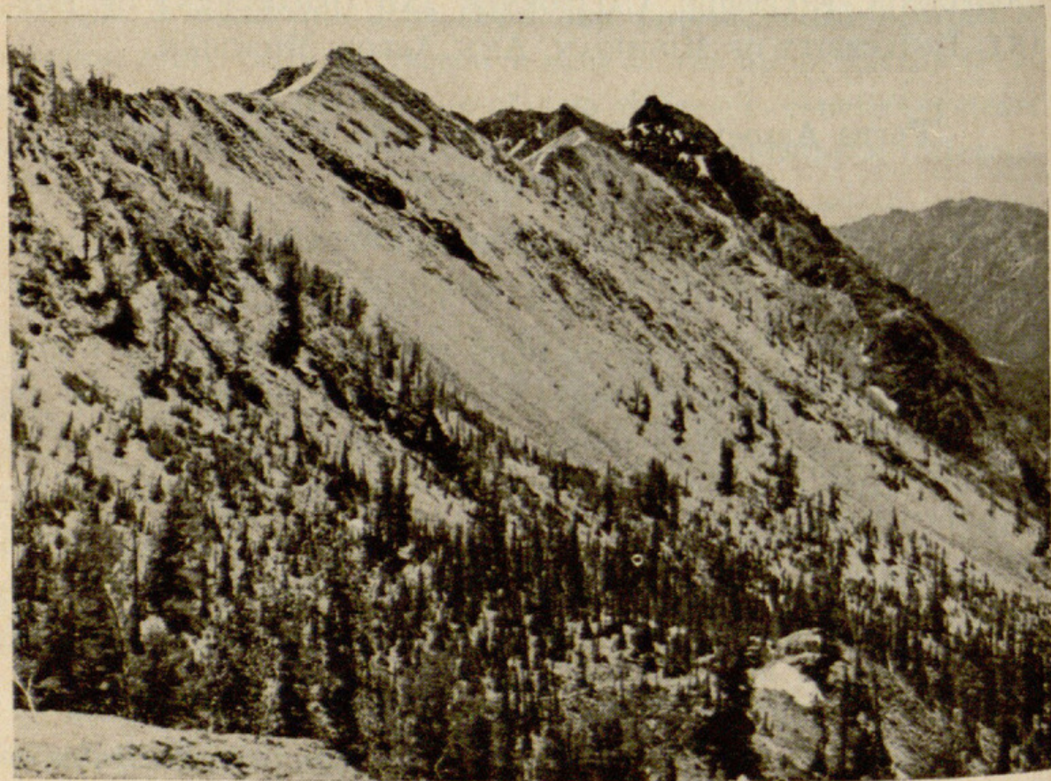
FIGURE 1. INGALLS PERIDOTITE AND SERPENTINE IN FOREGROUND; IRON PEAK (HAWKINS GREENSTONE FORMATION) AT END OF RIDGE. NOTE ABRUPT LITHOLOGICAL CONTACT AT THAT POINT. THE THREE "ULTRAMAFIC" FERNS ARE COMMON ON THE NEAREST SLOPES.

The term "ultramafic" embraces all those rock types in which the elemental composition is largely silicates of iron and magnesium. The commonest lithological forms of ultramafics are the