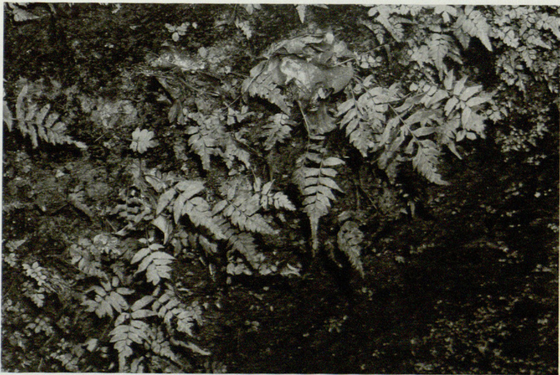
FIG. 2. Image of the vertical cave habitat and growth habit of Asplenium abscissum in Jackson County, AL. The mature fronds pictured are approximately 15–20 cm in length.