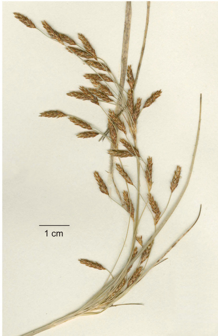
Fig. 2. Inflorescence of Cypringlea evadens (C. D. Adams) Reznicek & S. González [Breedlove 11204 (MICH)].

as the inflorescence; primary rays 5-15 ascending to curving with age, at least the thinnest more or less flexuous, flattened or compressed-trigonous, antrorsely scabrous on margins distally, smooth proximally, the longest 5-11 cm, second, third, and occasionally fourth order branching present, with the spikelets ultimately sessile or rarely short-peduncled (< 5 mm) in fascicles of 2-7 or rarely solitary at tips of primary or second order branches. Spikelets 25-200 per inflorescence, not more than 15% peduncled, linear-ellipsoid, 4-9.5 mm long, 1.7-2.7 mm wide, cuneate at base, acute at apex; scales somewhat spreading, loosely spirally arranged, with 2-4 sterile scales at the base of the spikelet (excluding the prophyll) and 8-25 fertile