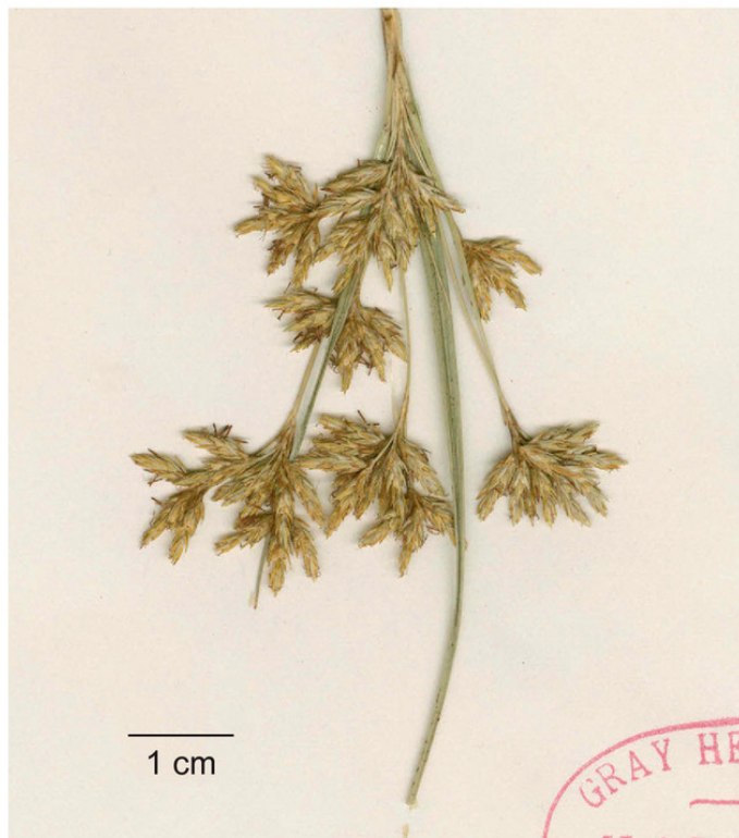
Fig. 1. Inflorescence of Cypringlea analecta (Beetle) M. T. Strong [ Purpus 5454 (GH, isotype)].

Cypringlea analecta (Beetle) M. T. Strong, Novon 13: 125. 2003. Scirpus analecta Beetle, Brittonia 5: 148. 1944 (as Scirpus analecti ). Type: Mexico. San Luis Potosí, Minas de San Rafael, May 1911, C. A. Purpus 5454 (holotype, NY; isotypes, F, GH, MO, UC (has date of July 1911 according to Strong, 2003), US).