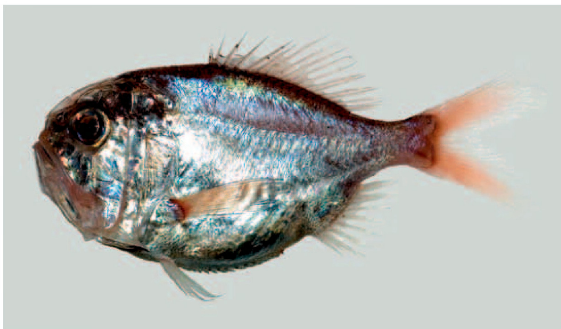
Figure 1. Hoplostethus ravurictus n. sp., holotype NMV A29668-002, 123 mm SL, Western Australia, Hedland, 407–404 m.