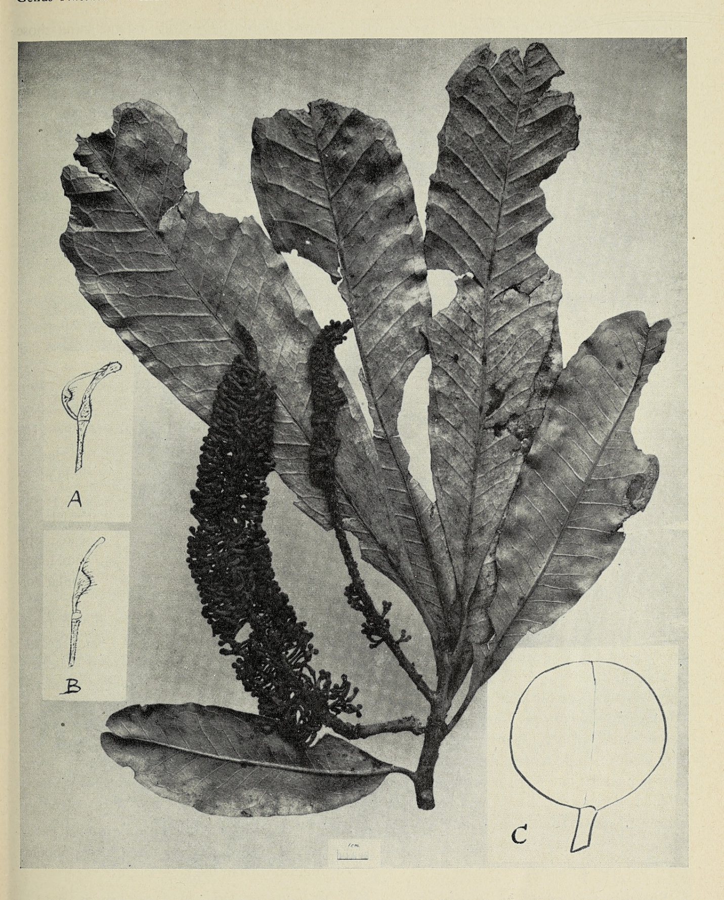
FIG. 1. Finschia ferruginiflora C. T. White. New Guinea: L. S. Smith 1093 (flowers) and 1060 (fruits). A, flower (slightly enlarged); B, gynaeceum (slightly enlarged); C. fruit.