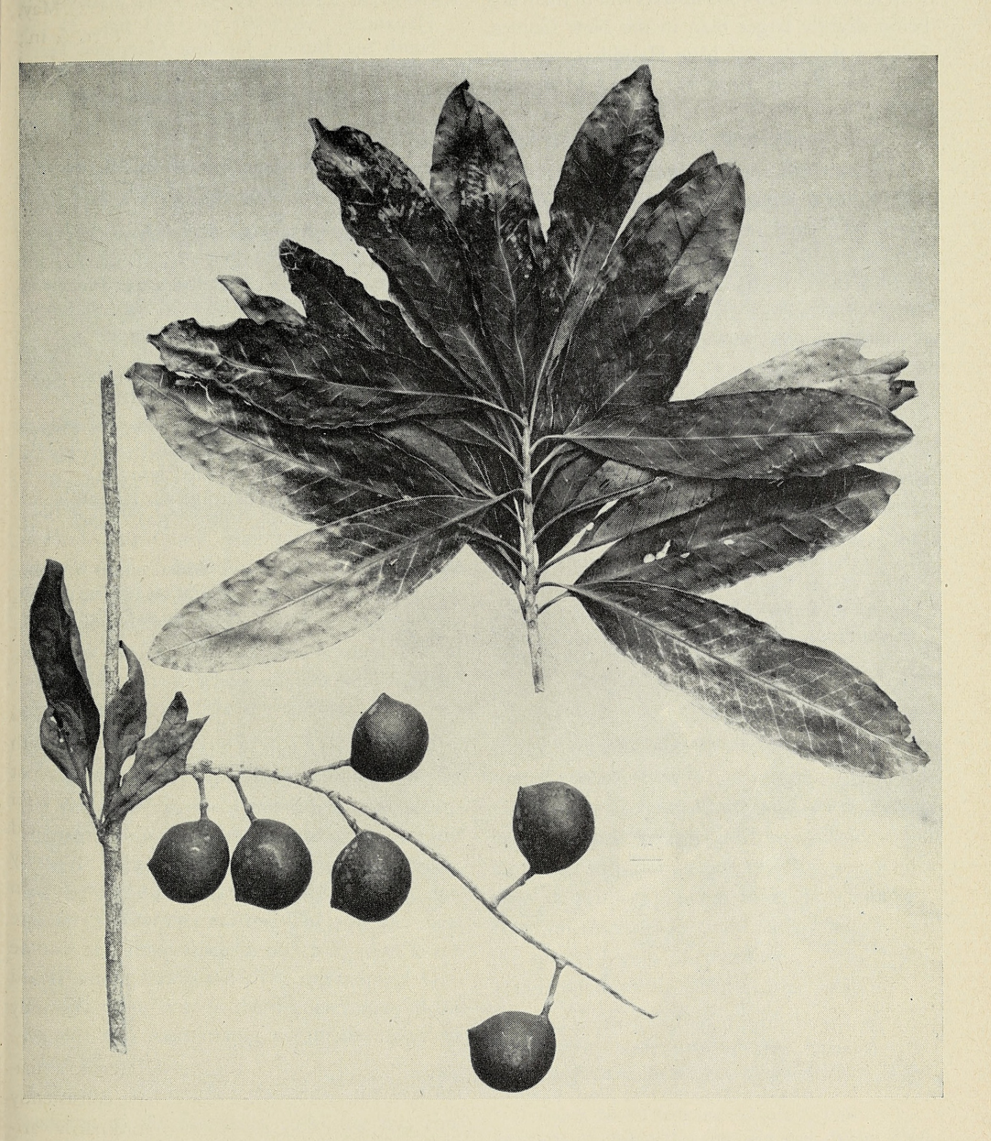
FIG. 3. Finschia chloroxantha Diels (Grevillea elaeocarpifolia Guillaumin). New Hebrides: S. F. Kajewski 350.