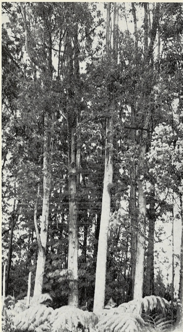
FIG. 2. Trunks of small-crowned trees in closed stands, normally free of persistent adventitious roots. This stand is in Glenwood, Hawaii.

crowned, fine-limbed trees typical of dense forests usually have trunks free of all but the finest roots (Fig. 2).