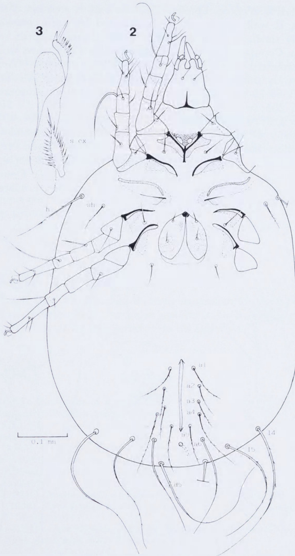
Figures 2-3 Tyroborus houstoni sp. nov. Female in ventral view (2), organ of Grandjean and seta s cx (3).