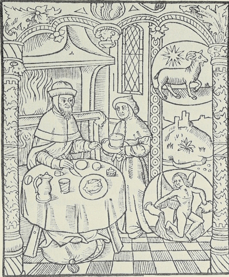
January. From To Everything There Is A Season.