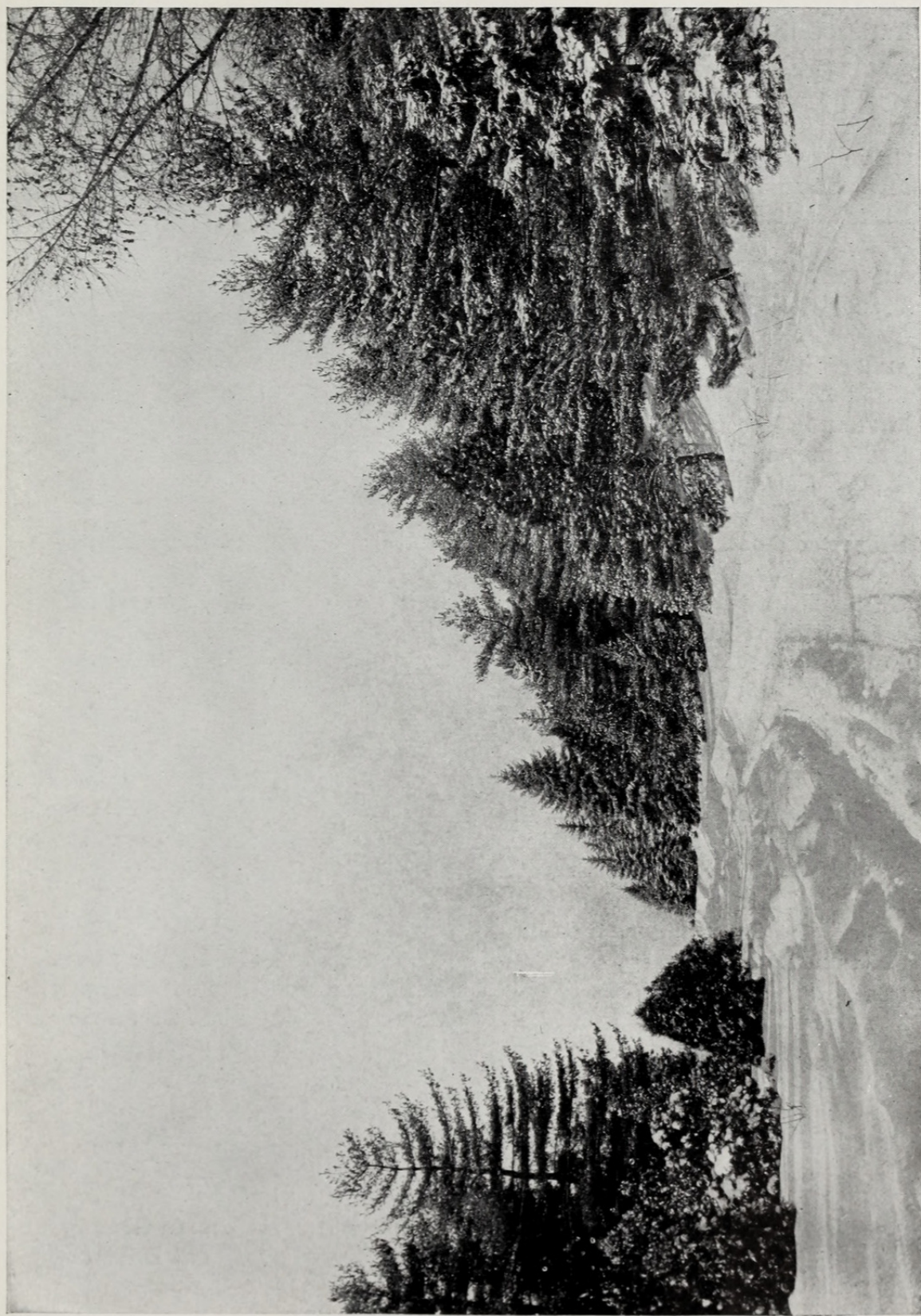
PINETUM, HIGHLAND PARK, ROCHESTER, N. Y.