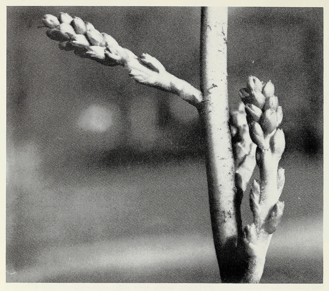
Pachysandra procumbens. The basal inflorescences are formed the summer prior to flowering and range in number from one to three per stem.

acid (NAA) when applied as dips (pure chemical dissolved in 50 percent ethanol) resulted in 100 percent rooting and large root systems.