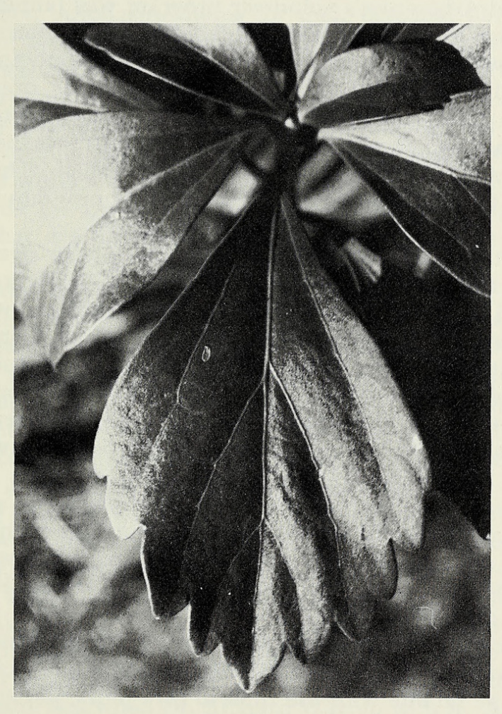
Mature leaf of Pachysandra terminalis showing wedge-shaped leaf base and prominent terminal serrations.