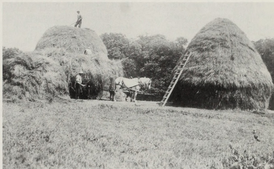
Haying near Center Street, 1931.

In spring, 1997, we will further mark the anniversary with the release of our new lilac introduction, Syringa x chinensis 'Lilac Sunday', to be made available, appropriately enough, on Lilac Sunday, May 18, 1997. A large garden party to formally honor 125 years of achievement in science and edu-