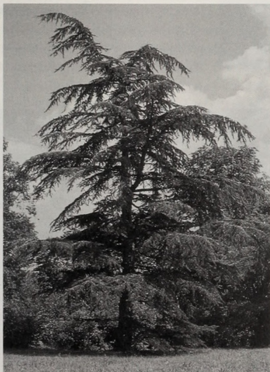
Cedrus libani stenacoma at the Arboretum.