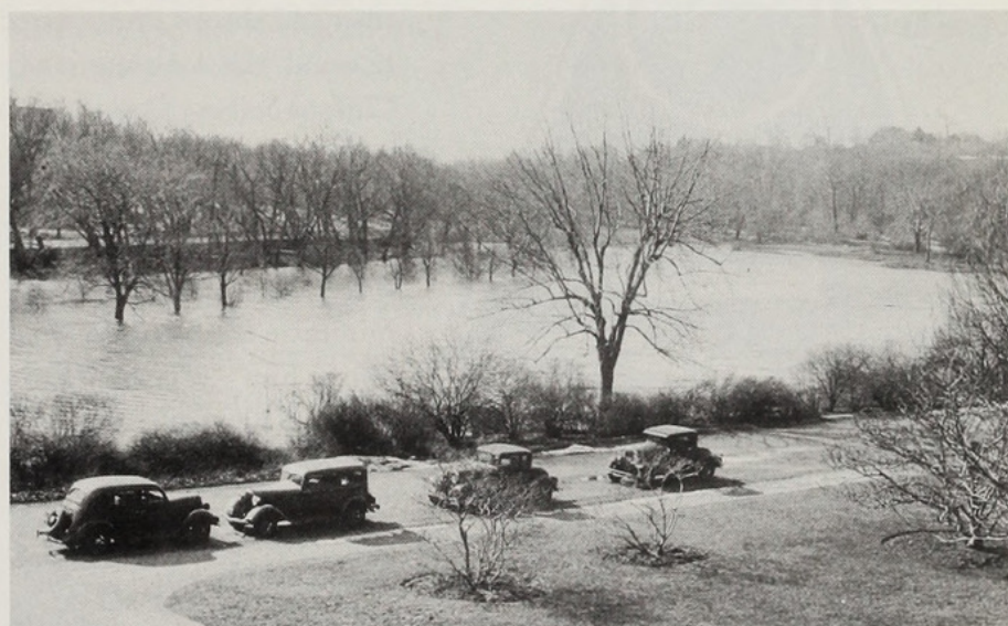
The meadow in flood, March 12, 1936.