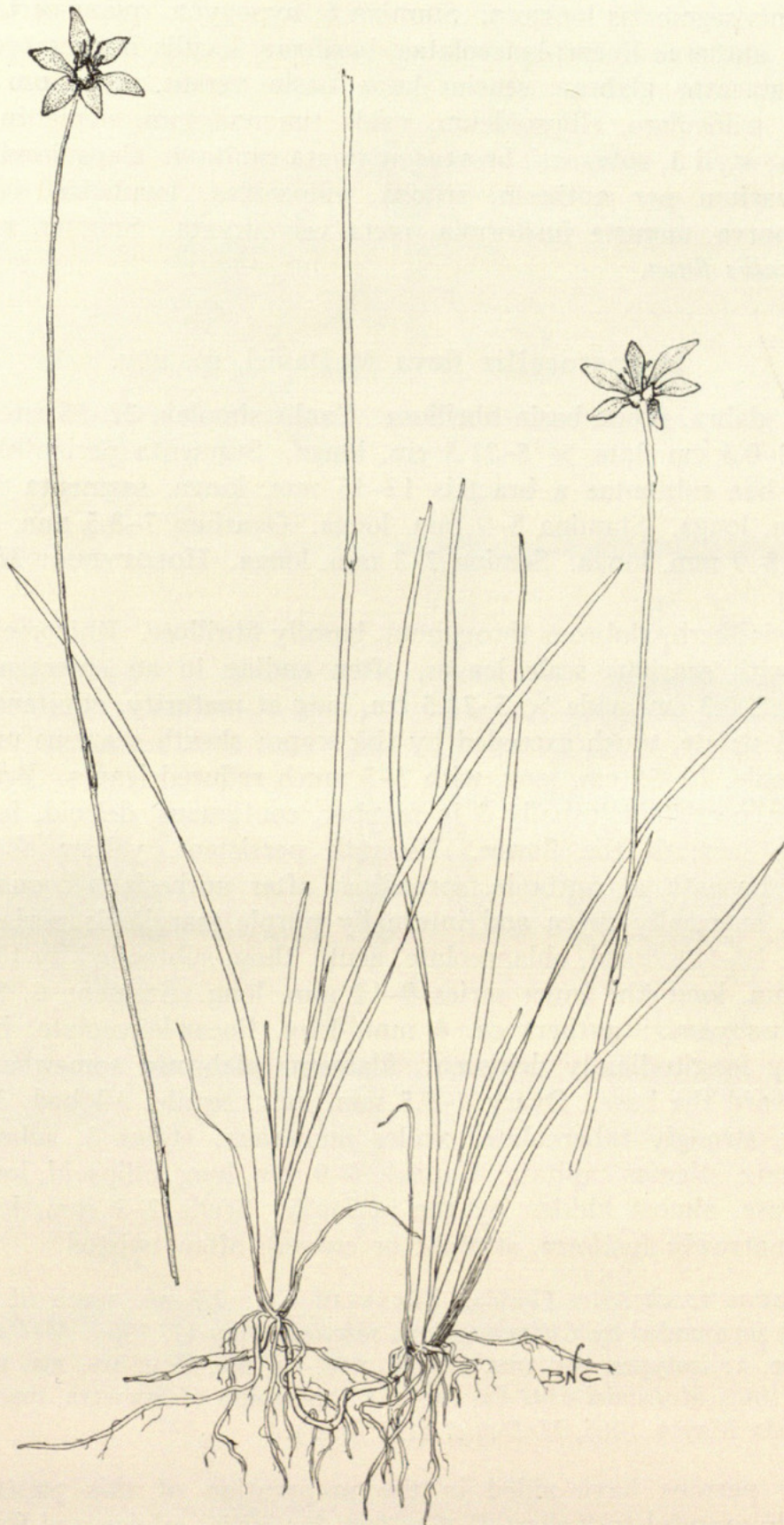
FIG. 1. Harperocallis flava , \times \frac{2}{3} .