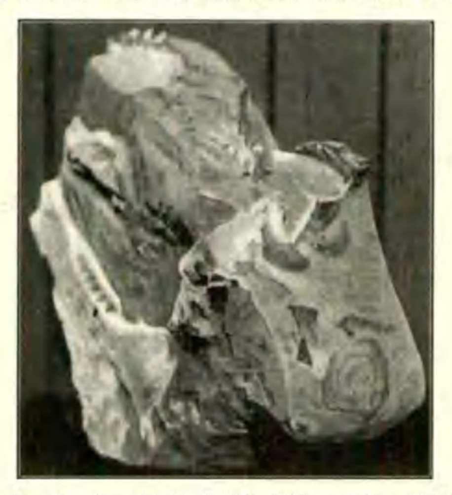
Fig. 3. Posterior view of base of skull of Mammalodon colliveri, Pritchard.

The groove showing the tooth to be two-fanged starts from the base of the crown on the outer surface, deepening for half the length of the root, the remaining half showing the two fangs free and parallel with a distinct backward curvature, on the inner surface even the crown itself is somewhat indented near the root.