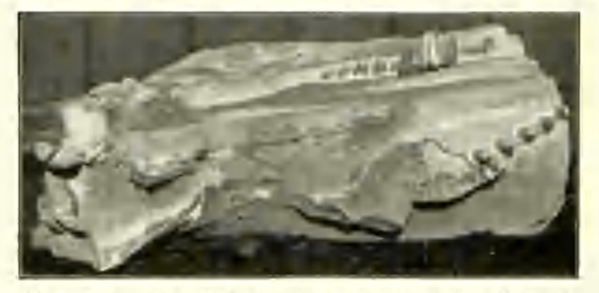
Fig. 1. Top view of teeth and jaws of Mammalodon colliveri, Pritchard; also single two fanged molar obtained close to the above specimen.

The occurrence of our first fossil whale remains was recorded by the late Sir Frederick McCoy (1), as far back as 1864, when