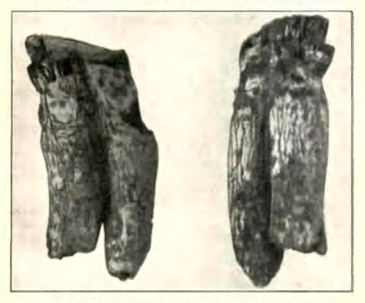
Left: Fig. 4. Internal aspect of Molar Tooth, X 2. Right: Fig. 5. External aspect of Molar Tooth, X 2.

Marked features may be summed up as very small crown to length of root, teeth set very close together in groups with a very definite rake, each molar and praemolar distinctly medially grooved