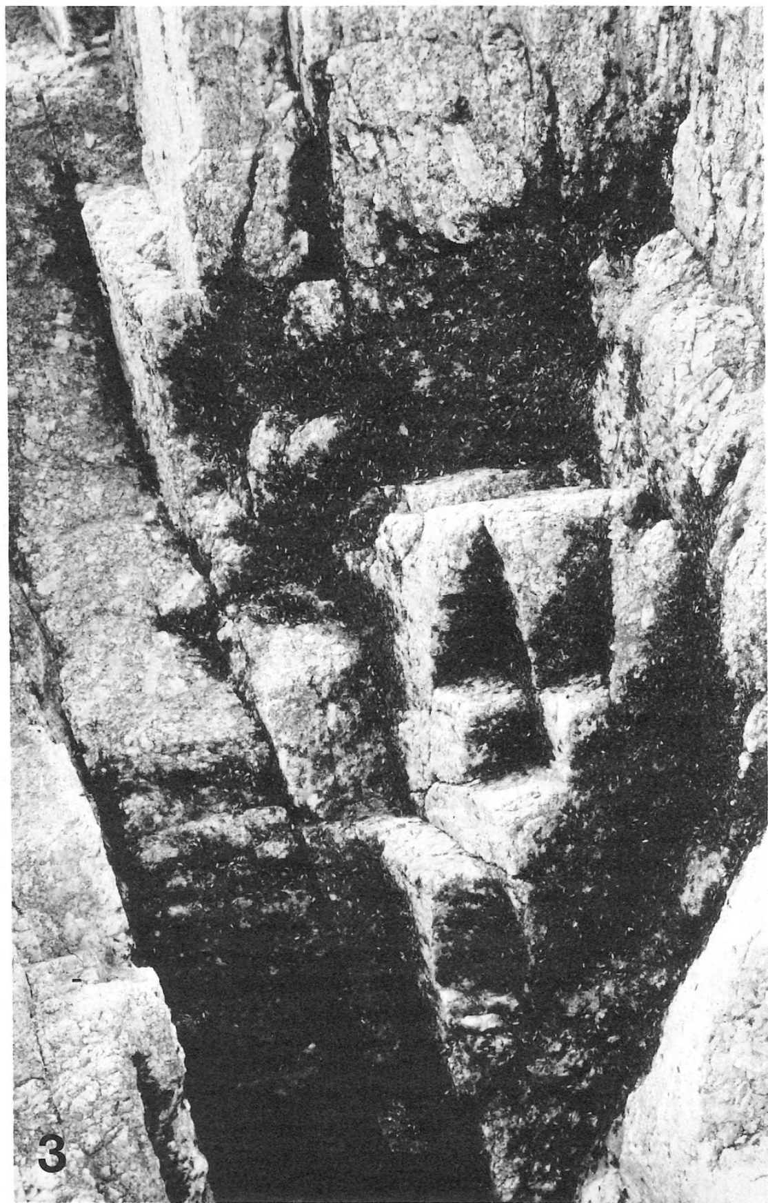
Fig. 3. Aggregation of Coelopa ( Neocoelopa ) vanduzeei Cresson located about a meter and a half from left end of granitic rock outcrop illustrated in Figure 1.