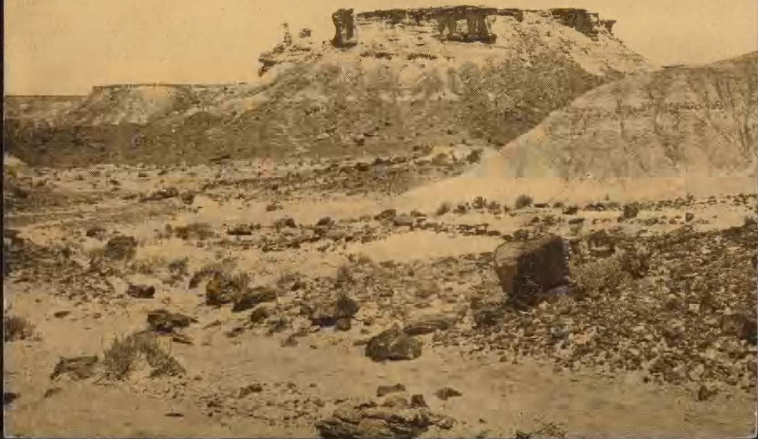
3134. In First Petrified Forest, Adamana, Arizona.