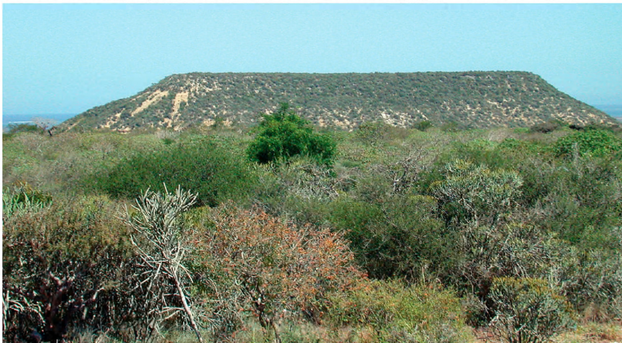
FIGURE 2. La Table in southwestern Madagascar (looking westward toward Mozambique Channel), habitat of Anisotes tablensis .

Anisotes tablensis is known only from the type collection. It is the third species of the genus known from the dry regions of southwestern Madagascar. The geographic coordinates given on the