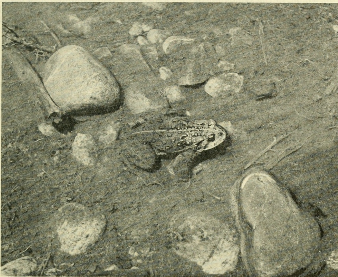
Fig. 2. Male boreal toad in the breeding pond 8 miles southeast of Hamilton. Typical waiting position of the male in shallow water along shore.

The ponds were visited at night on 18 May, with the recorded protest chirps. At night the males were extremely hard to find; most were floating in the deeper water and only a few were close to shore. The recorded protest calls did attract several males; however, few attempts at clasping were noted. It appeared that practically all breeding activities ceased at night. Even though water temperatures were not taken at night, they were not much lower than the day-time temperatures.