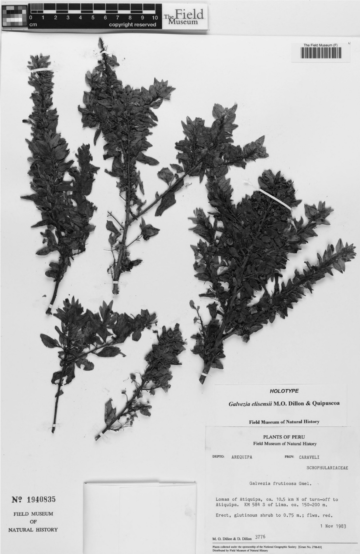
FIG. 1. Galvezia elisensii . Photograph of holotype collection, M. Dillon & D. Dillon 3776 (F1940835).