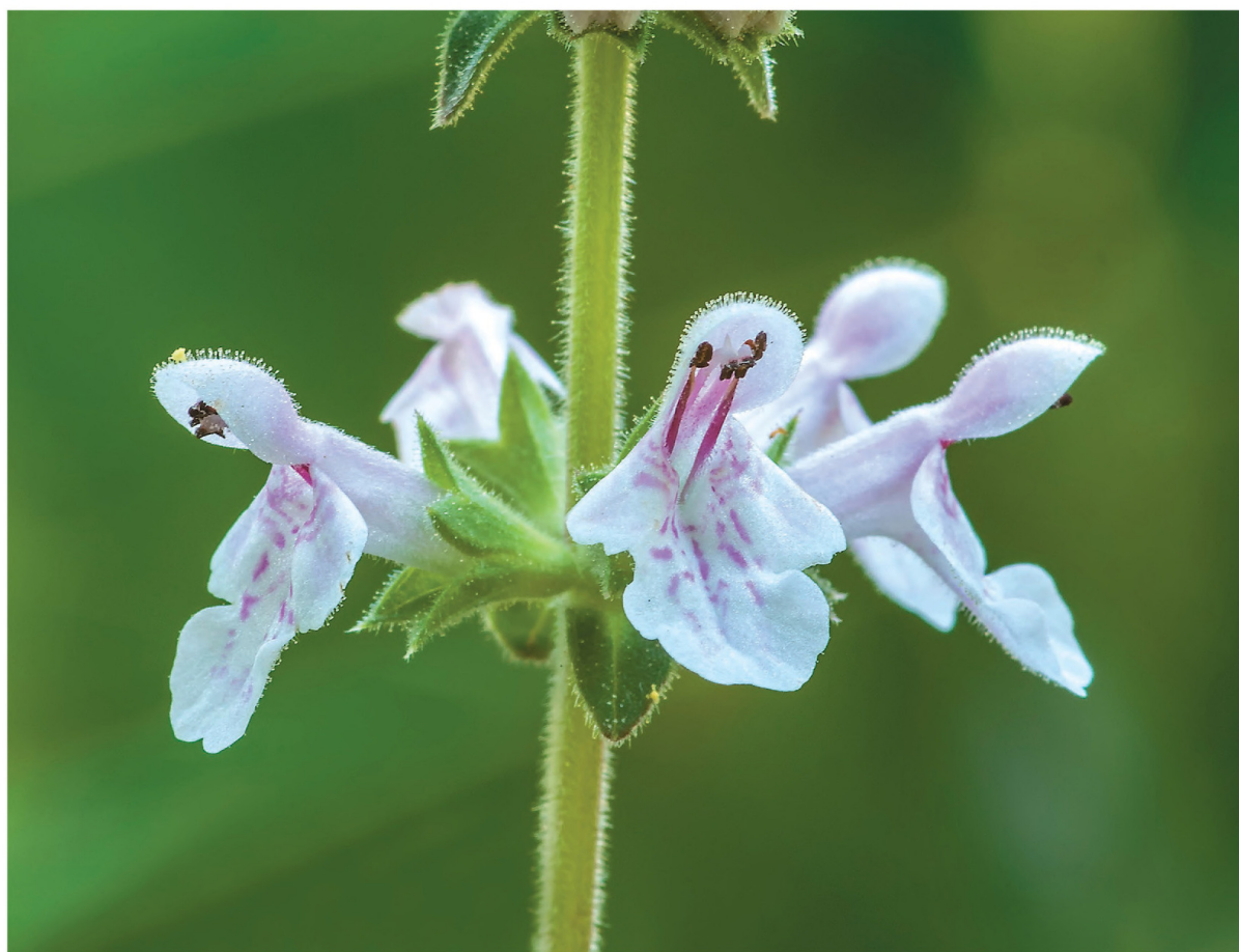
FIG. 2. Open flowers at a single node of Stachys caroliniana .

6-flowered; bracteoles narrow, spinulose, glandular and pubescent, 0.5–0.8 mm long; flowers perfect and fertile; calyx campanulate, densely short-soft pubescent, with abundant delicate, stipitate glands; fruiting calyx 5.5–7 mm long, the tube (to base of lobe sinus) 3.5–4 mm, the lobes 2–3 mm; lobes abundantly hairy with eglandular and stipitate glands, especially along veins, deltoid to lanceolate, mostly \frac{1}{2} the length of the tubes, each lobe terminated by a pale apiculum; corolla tubular and galeate, from base to galea apex 13 mm long at full anthesis; corolla tube prominently saccate toward base on lower side, internally glabrous, but with prominently slanting (oblique) annulus, copiously pubescent with soft, bulbous trichomes; corollas white, scarcely pinkish, save for scattered spots on lower lip, the lower corolla lip declined up to 90° from tube, to 7 mm long, the central lobe nearly rotund, 4–5.5(–6) mm broad; filaments pink, with short, capitate glands as well as bulbous trichomes; mericarps 1–1.2 mm broad, 1.6–1.8 mm long, dark brown, minutely pebbled.