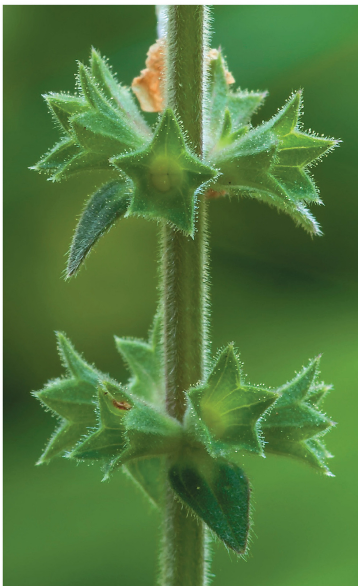
FIG. 3. Flowers in early fruit of Stachys caroliniana .

flatwoods and a freshwater marsh; this population has not been seen since its first collection. The same plant was collected again in 1990 in Georgetown County, in its only other known locality (the type locality), approximately 8 air miles (13 km) to the northeast of the first collection, this on the north side of the Santee River. This second site is 10.4 air miles (17 km) south of the city of Georgetown on the west-central part of Cat Island, within the Tom Yawkey Wildlife Center, also managed for wildlife by SCDNR, in Georgetown County (Nelson 2002). The site of the type collection is barely 0.4 miles (about 600 m) east of the Intracoastal Waterway. The Yawkey Center collection is in habitat similar to that of the Charleston County population, along the south side of the Santee River. [The watershed of the Santee River effectively drains nearly half of South Carolina, when in fact its watershed is much more important—biologically and culturally—in neighboring Georgia (Edgar 1998)].