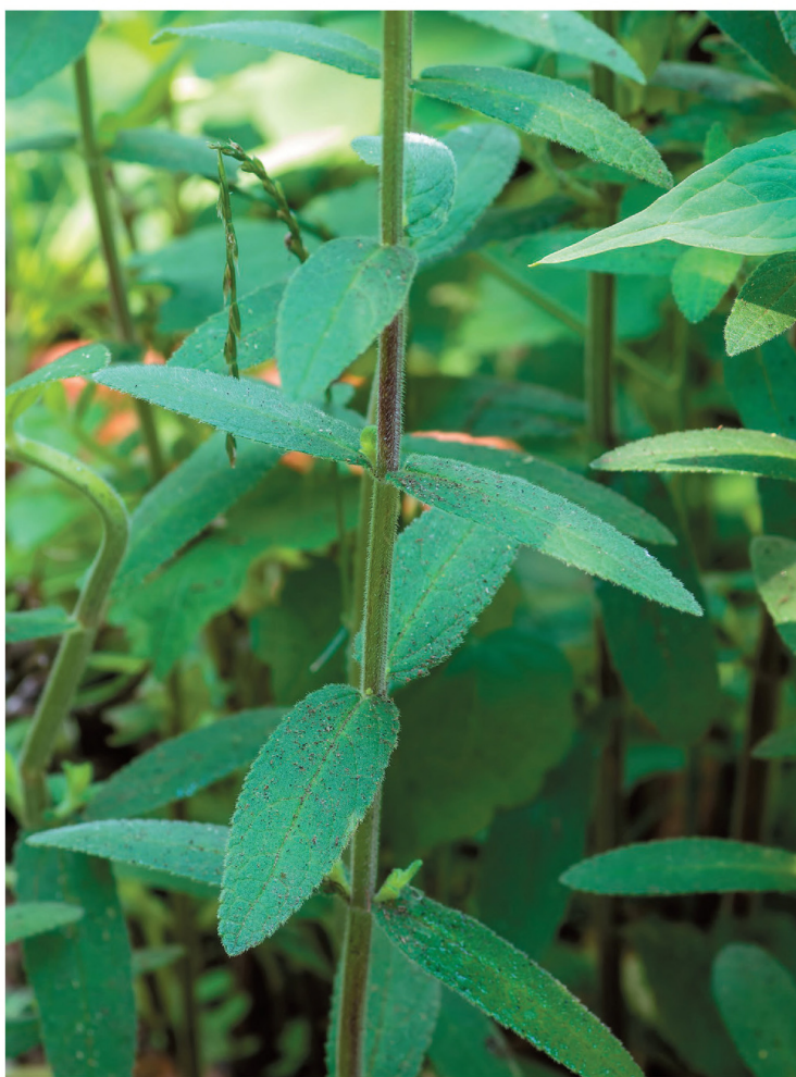
FIG. 4. Midstem leaves and stem of Stachys caroliniana.

known to occur in Charleston and Georgetown counties are the two relatively uncommon natives S. aspera and S. tenuifolia , as well as the widespread and weedy S. floridana . These three sympatric taxa, as well as others, are discussed below.