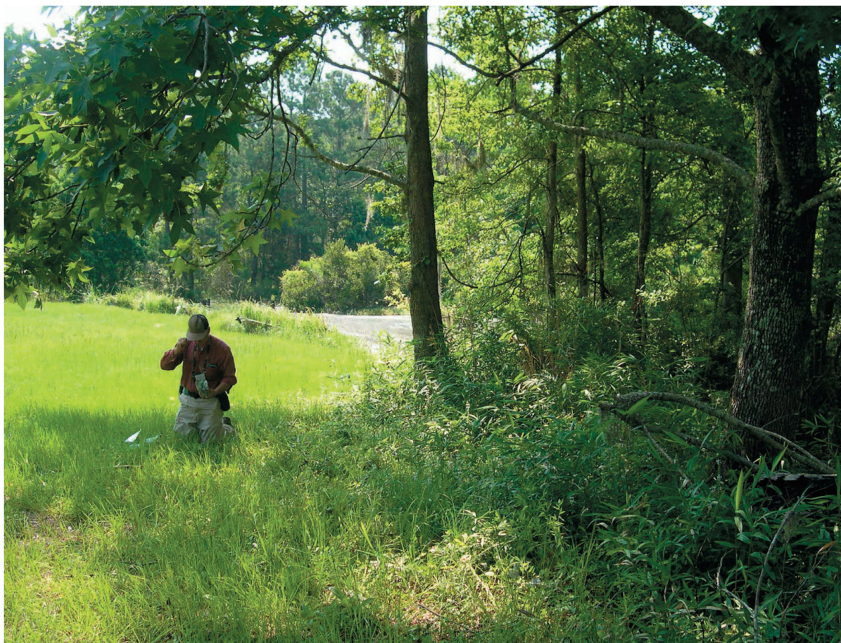
FIG. 5. Habitat at type locality of Stachys caroliniana , John Cely pictured.

and West Virginia and is known additionally from a number of upland, “interior” sites. This is a variable taxon, most often with glabrous/glabrate stems, these not infrequently slightly retrorse-hispidulous. This taxon always features prominently petioled leaves with blades which are lanceolate or elliptical, and usually with strongly serrated margins, with the plants commonly branching well below the first fertile node. Its corollas are distinctly pink. Calyx lobes of S. tenuifolia , in fruit, are commonly curled backward. Stachys tenuifolia has also been regarded as a near relative of S. hispida , the two taxa sometimes intergrading (Cooperrider & Sabo 1969).