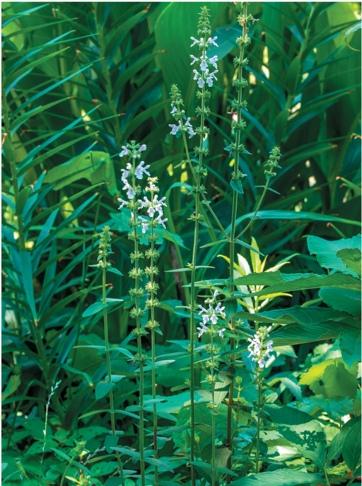
FIG. 1. Flowering stems of Stachys caroliniana .