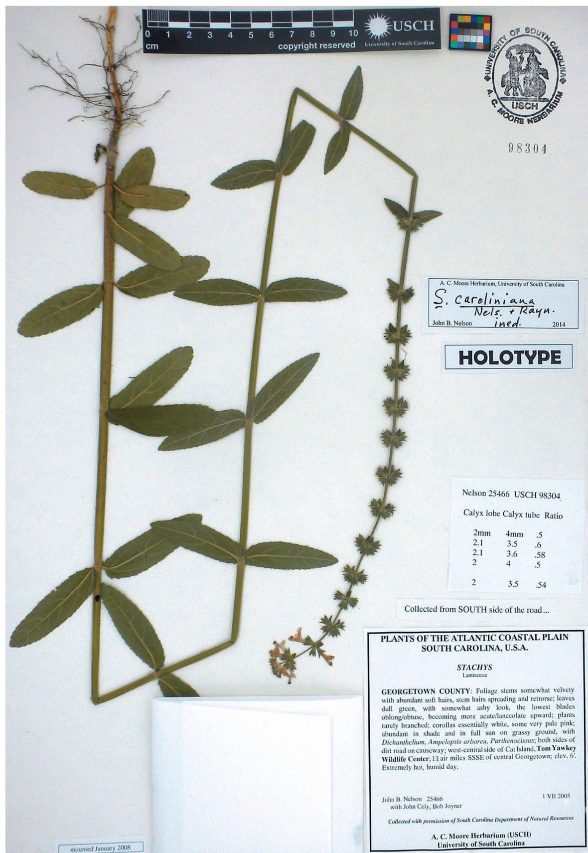
FIG. 7. Holotype of Stachys caroliniana (Nelson 25466).