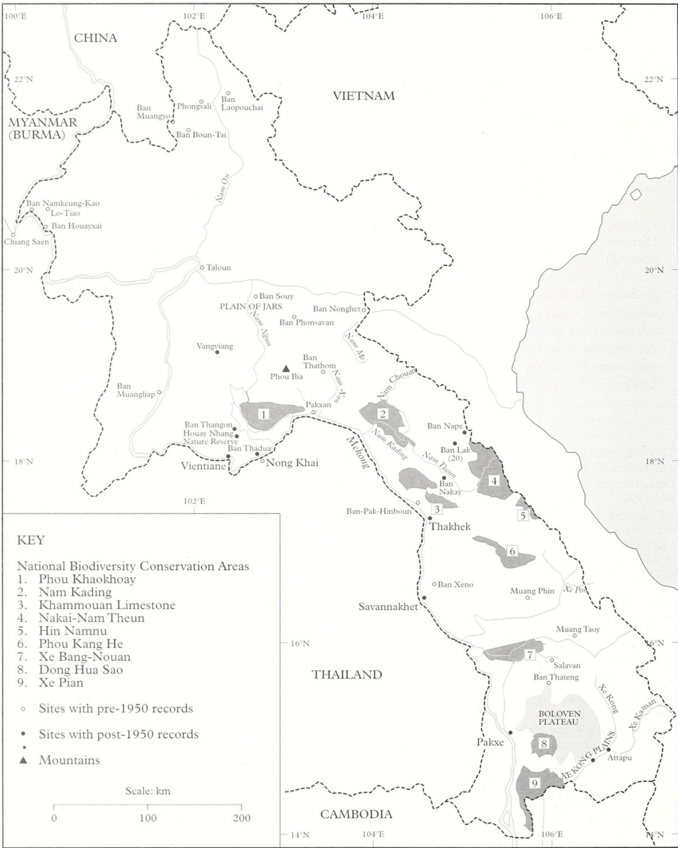
Figure 1. Laos, showing localities mentioned in the text and Provinces

A. The Nam Kading NBCA includes 1,570 km 2 of evergreen forest on steep terrain at 160–1,600 m. The reserve is bisected for 59 km by the Nam Kading (known as the Nam Theun in its upper reaches), whose altitude drops from 380 to 160 m. A major tributary, the Nam Mouan, also crosses the NBCA. Rapids render the Nam Kading within much of the NBCA non-navigable. People visit these areas only infrequently, usually for specific