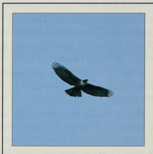
Plate 2. Adult Rufous-bellied Eagle Hieraaetus kienerii in flight.