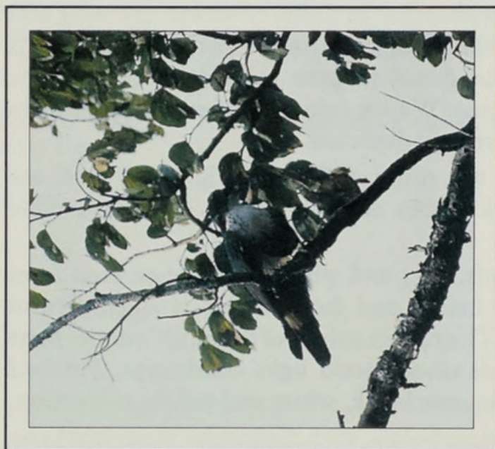
Plate 1. Adult Rufous-bellied Eagle Hieraaetus kienerii .