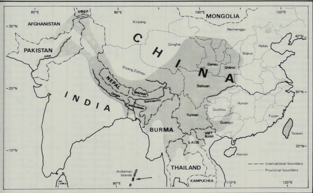
Figure 2. The distribution of birds under review (represented by shading).

C. Inskipp and T. P. Inskipp, 65 Swaynes Lane, Comberton, Cambridgeshire CB3 7EF, U.K.