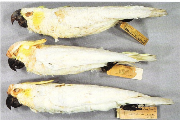
Plate 2. Males of three geographically adjacent taxa of Cacatua sulphurea : top C. s. sulphurea (AMNH 153742—old USNM number visible on label; Kwandang, Sulawesi); middle C. s. djampeana (AMNH 266486; Kayuadi, Tanahjampea); bottom C. s. paulandrewi (AMNH 619651; Wanci, Tukangbesi) type specimen.

The case of occidentalis is mildly more complicated. White & Bruce (1986), unaware of the consistently longer tails of Timor birds, merged it with parvula in the belief that bill size increases clinally westward from Timor. This is mistaken: measurements of bills of males ranging from Timor westward are: Timor 33.5 ( n = 4 ), Alor 37.1 ( n = 1 ), Pantar 37.3 ( n = 2 ), Flores 37.1 ( n = 3 ), Lombok 36.8 ( n = 2 ) and Nusa Penida 36.7 ( n = 5 )—the non-Timorian sample thus being remarkably consistent. White & Bruce (1986) also mentioned that Meise (1930) ‘considered birds from Pantar and Alor identical with those of Tanahjampea and Kalao, relying on the size of the bill’, but this too is mistaken: Pantar and