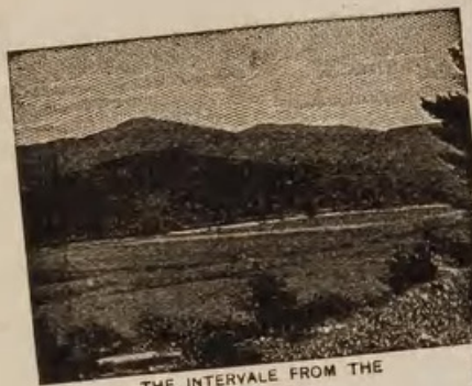
THE INTERVALLE FROM THE PINE GROVE