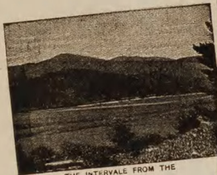
THE INTERVAL FROM THE PINE GROVE