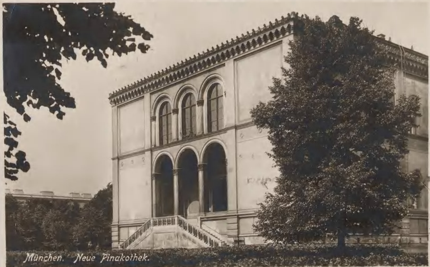
München. Neue Pinakothek.