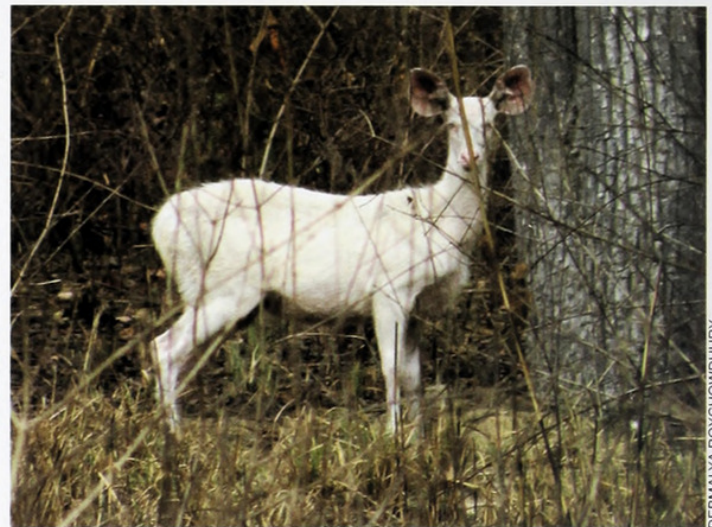
Fig. 1: Albino Sambar Rusa unicolor sighted at Corbett Tiger Reserve

Earlier Champion (1938) sighted an albino Sambar hind in the mixed Sal and Chir pine forest near Chaukhamb in the hills of Kohtri valley. Pillay (1953) also reported seeing an albino Sambar hind and an albino Sambar stag from Talamalai range of north Coimbatore. Another record of a museum specimen of albino Sambar from the Archaeological Museum of Udaipur was given by Tehsin (2006). Sangai Express