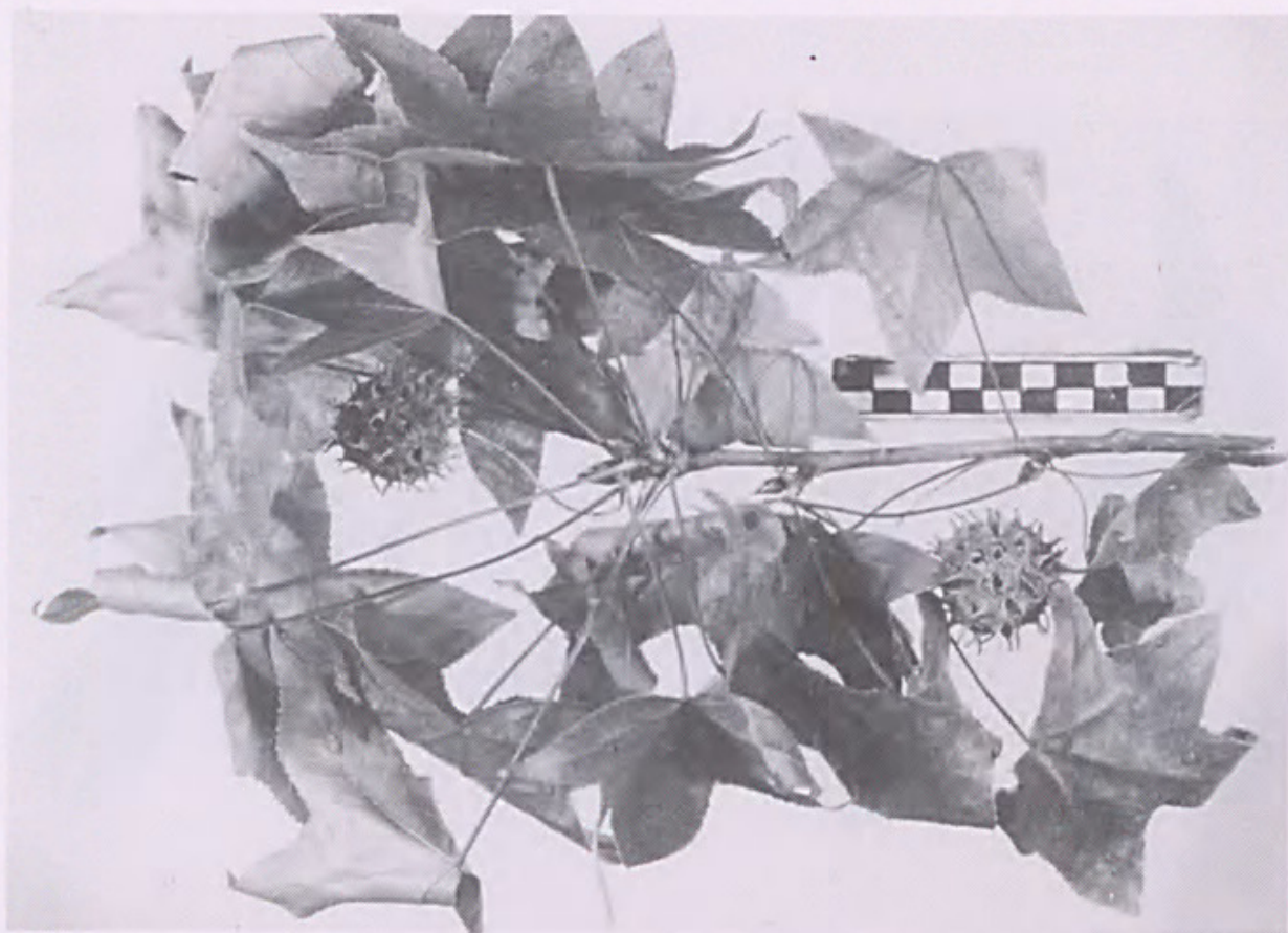
Figure 1 Branchlet of Liquidamber with fruit attached (scale bar equals 1 cm).

Freshly fallen fruit were collected and voucher material has been lodged with the Western Australian Museum.