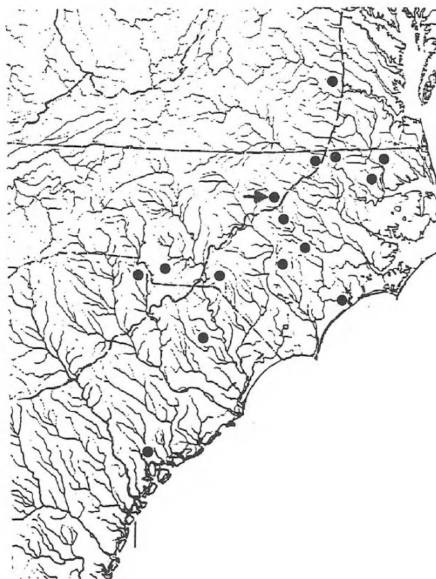
Fig. 1. Distribution records for Collops balteatus in Virginia and the Carolinas. The western edge of the Coastal Plain is approximated by the dashed line. The site of earliest collection (Raleigh, 1958) is indicated by the arrow.

With such a fragmentary background for the beetle, it was a surprise to learn that C. balteatus is abundant and widespread in eastern North Carolina, represented by over 60 specimens from 11 counties in the NCSU collection (Fig. 1). The earliest capture date among this material is 1958, at Raleigh. Since Brimley (1938) did not list the species for North Carolina, it seems reasonable to assume that it arrived there sometime during the following