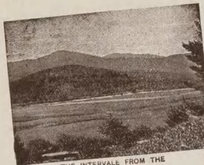
THE INTERVAL FROM THE PINE GROVE