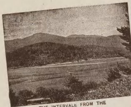
THE INTERVAL FROM THE PINE GROVE