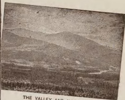
THE VALLEY AND MOUNTAINS FROM CABOT