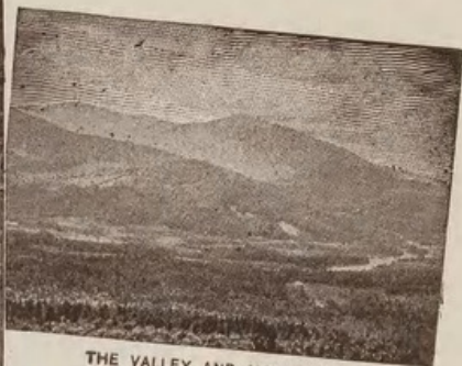
THE VALLEY AND MOUNTAINS FROM CABOT