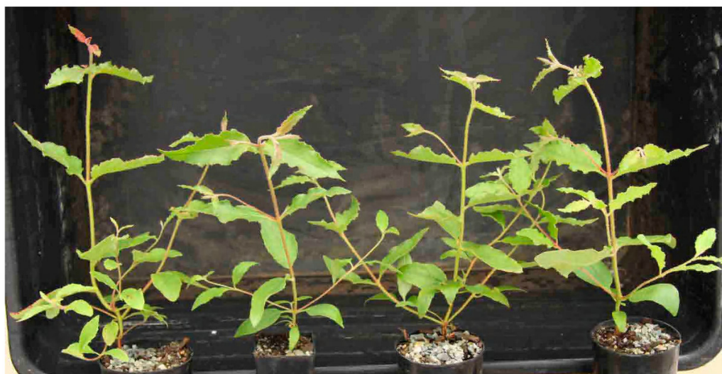
Fig. 4. Four seedlings (from many grown) of Eucalyptus expressa , ex Melon Creek, Yengo National Park (Nicolle 5266 & Bell).

Seedlings have been grown from the Putty Road and Melon Creek populations of E. expressa (Fig. 4). The seedling morphology within and between these populations is consistent, providing further evidence that the new species is not of recent hybrid origin. In general, the seedlings are morphologically similar to E. eugenioides .