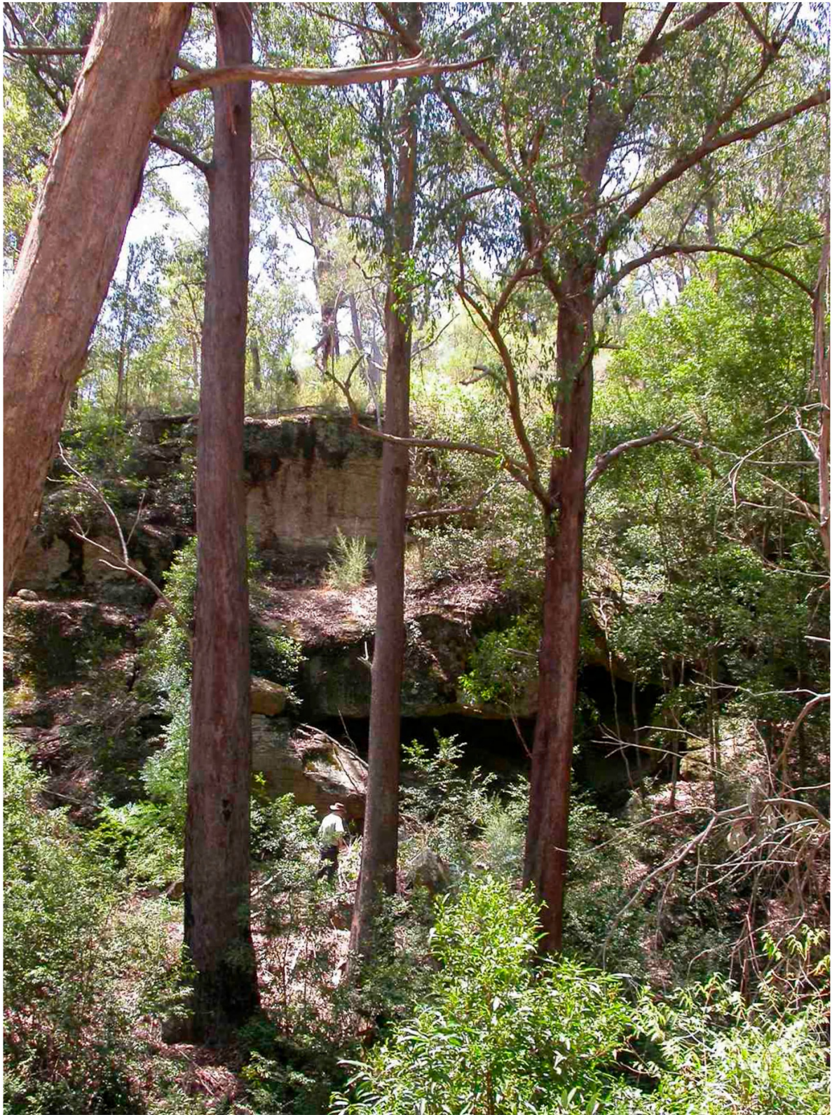
Fig. 2. Habitat and habit of Eucalyptus expressa (three centre trees; leaning tree in upper left is E. piperita ) - Parsons Creek alongside Putty Rd, SW of Bulga, 32°45'07"S, 150°55'22"E, 30 Jan 2009, Nicolle 5265 & Bell (AD, CANB, NSW, BRI). Note one of us (SAJB) in image for scale.