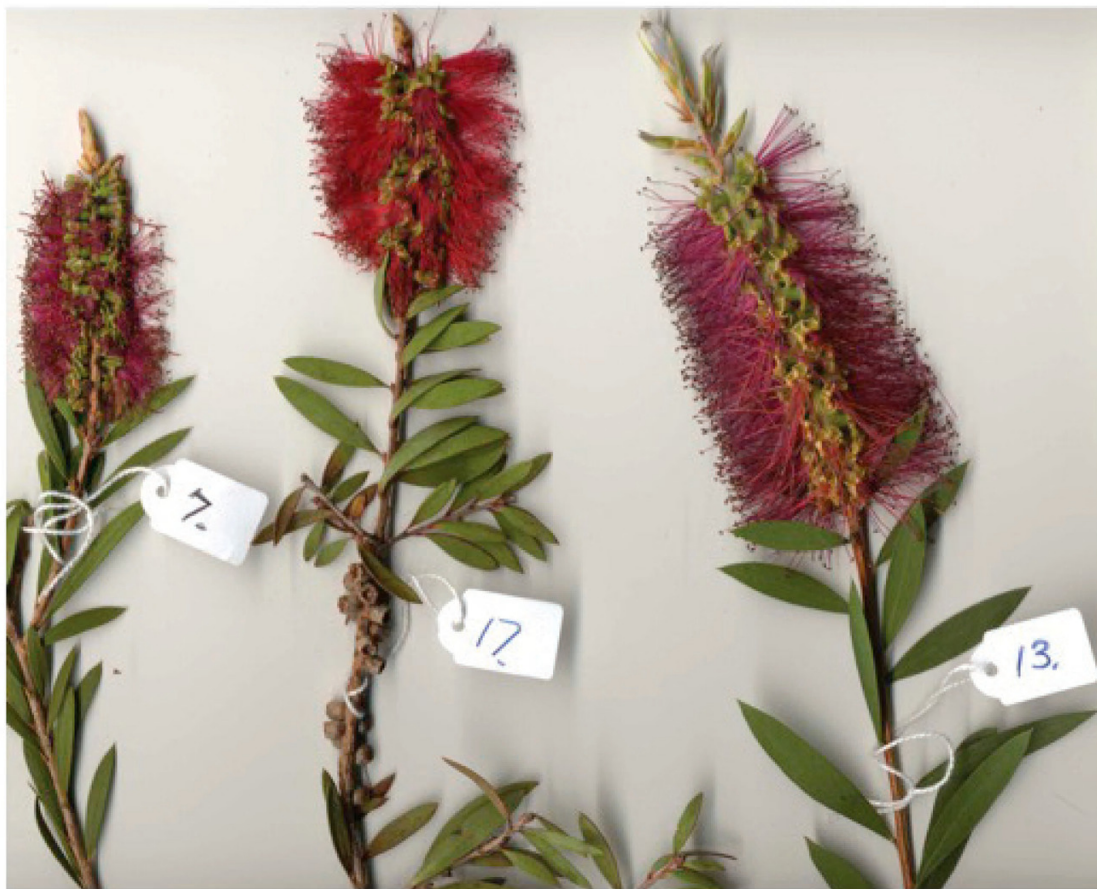
Fig. 4. Comparison of inflorescences and leaves of Callistemon species. Specimen tagged 7 is Callistemon megalongensis with the narrowest inflorescence and narrowest leaves that are also the most pungent-pointed; specimen 17 is C. citrinus with wider inflorescence and wider leaves than C. megalongensis ; specimen 13 is C. purpurascens with the widest and longest inflorescence and leaves.