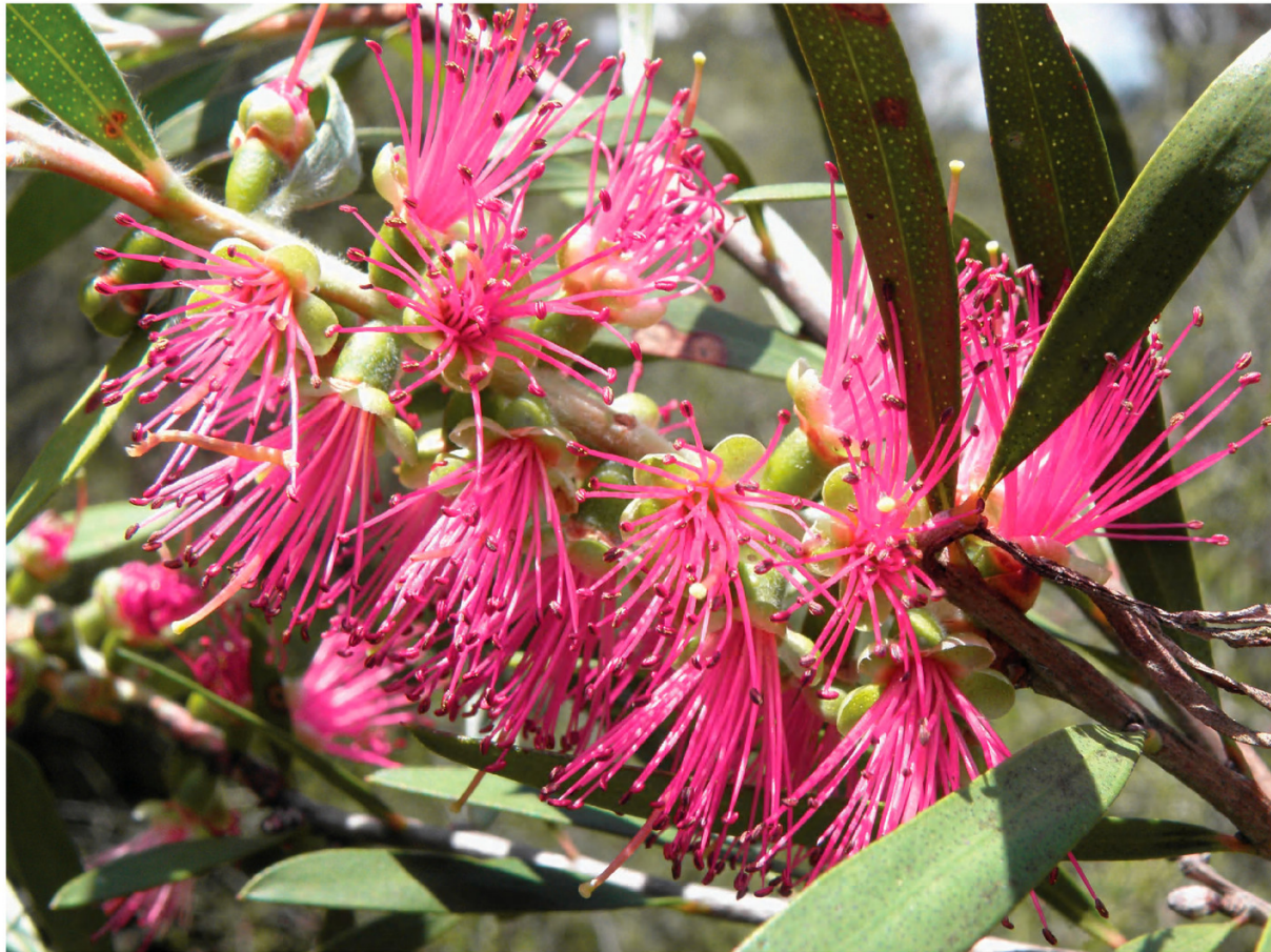
Fig. 1. Callistemon purpurascens , showing leaves and inflorescence, with pale green sepals, drying brown, and purplish stamens.

The fruits of C. purpurascens are more globose and have a relatively narrower aperture for their size when compared to the more barrel-shaped, wider-aperture fruits of C. citrinus . This is the most reliable distinguishing characteristic between these two species (Figs 2, 4). In addition, the leaves of C. purpurascens are generally longer and wider than those of the local forms of C. citrinus (Fig. 3).