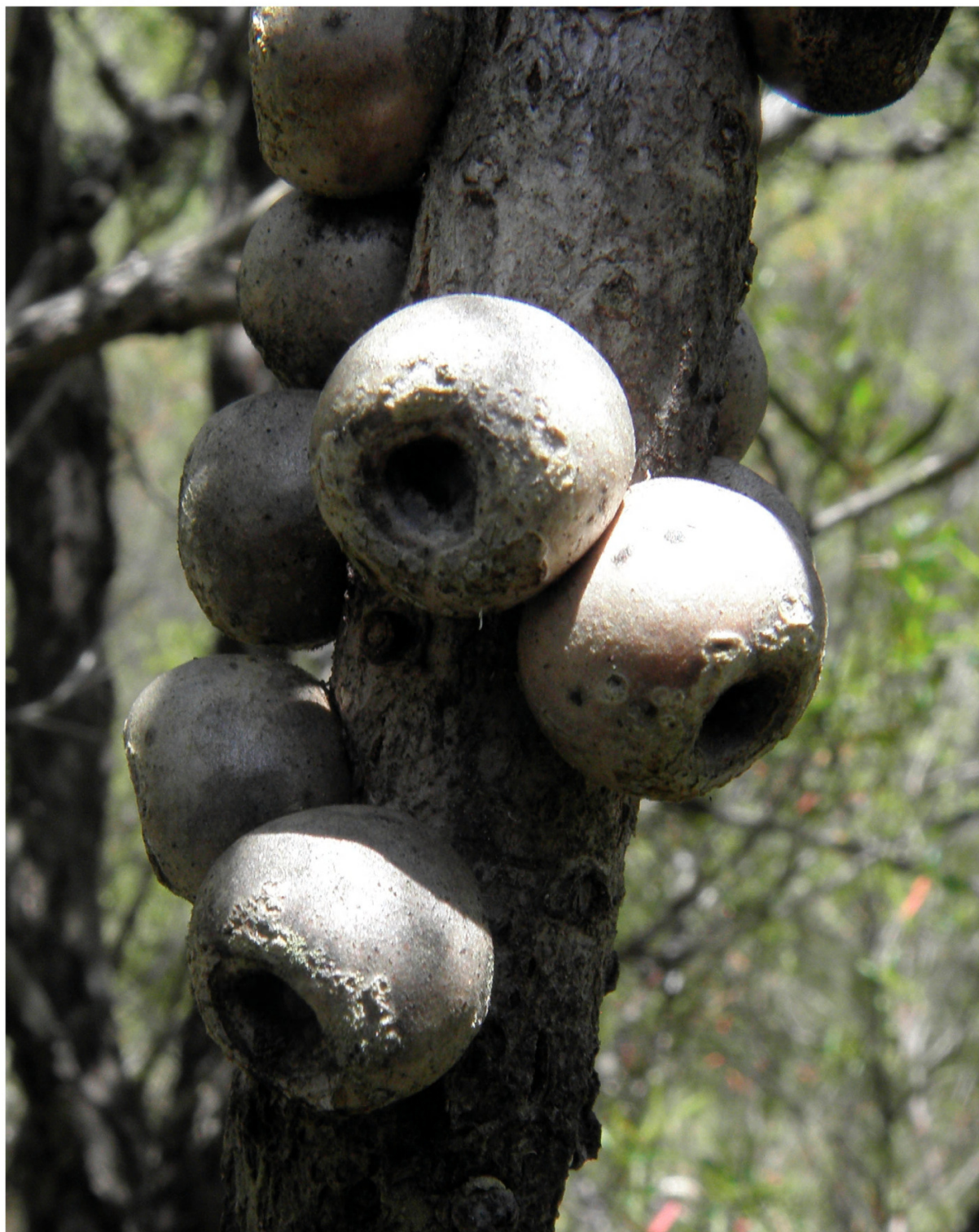
Fig. 2 Callistemon purpurascens , showing mature fruits with characteristically narrow aperture relative to fruit diameter