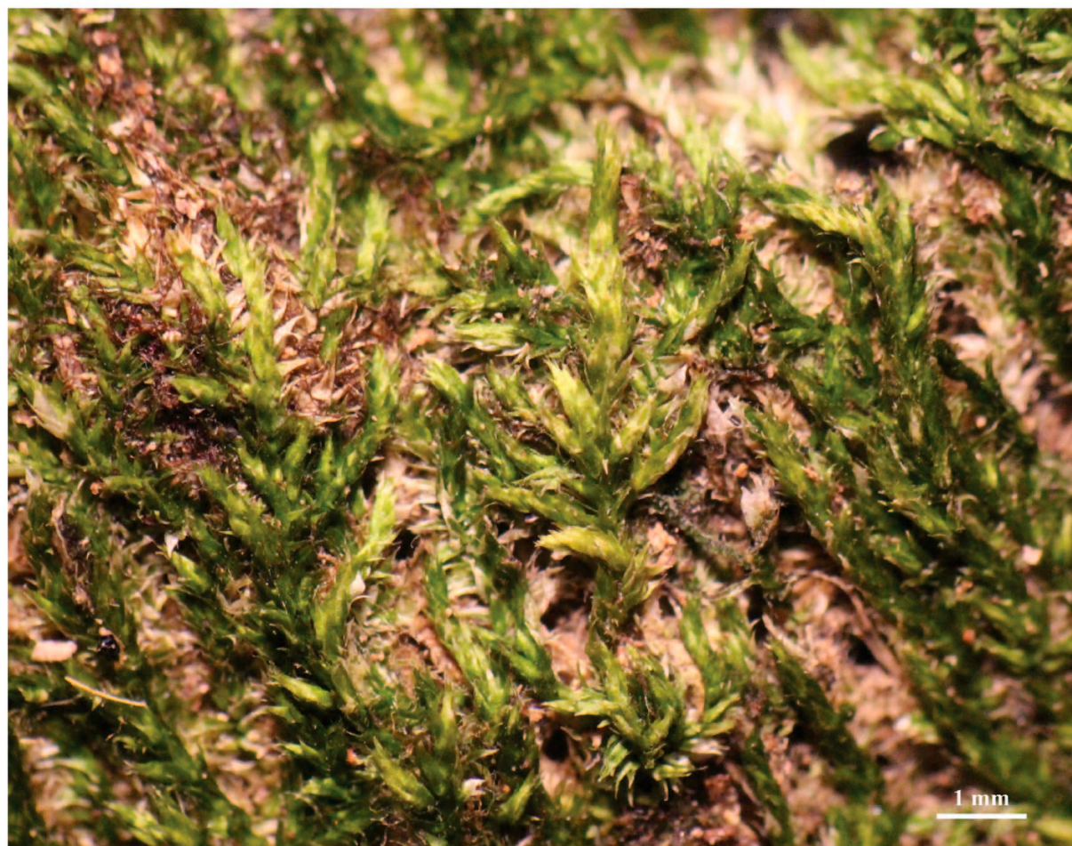
Fig. 1. Habit of Schwetschkeopsis fabronia (Schwägr.) Broth.

In Thailand, this species is readily distinguishable among small pleurocarpous mosses by its complanate foliate branches (Figs 1, 2A), absence of a costa (Fig. 2C, D), and cells papillose-projecting at upper angles of lamina, especially near the leaf apices and margins (Fig. 2E, F). However, the papillosity of the leaf cells due to the projecting upper cell ends may not be distinct in some stage of the plants. Schwetschkeopsis fabronia was reported from north-eastern China across the central to the south-western part of the country in Yunnan and Xizang. The distribution in Thailand represents a further range extension of this species to mainland Southeast Asia in addition to Vietnam (He and Khang 2012). The recent discovery of this species indicates that the bryophyte flora of Thailand still remains inadequately known and future floristic work should continue and be more focused in this country, which is rich in biodiversity.