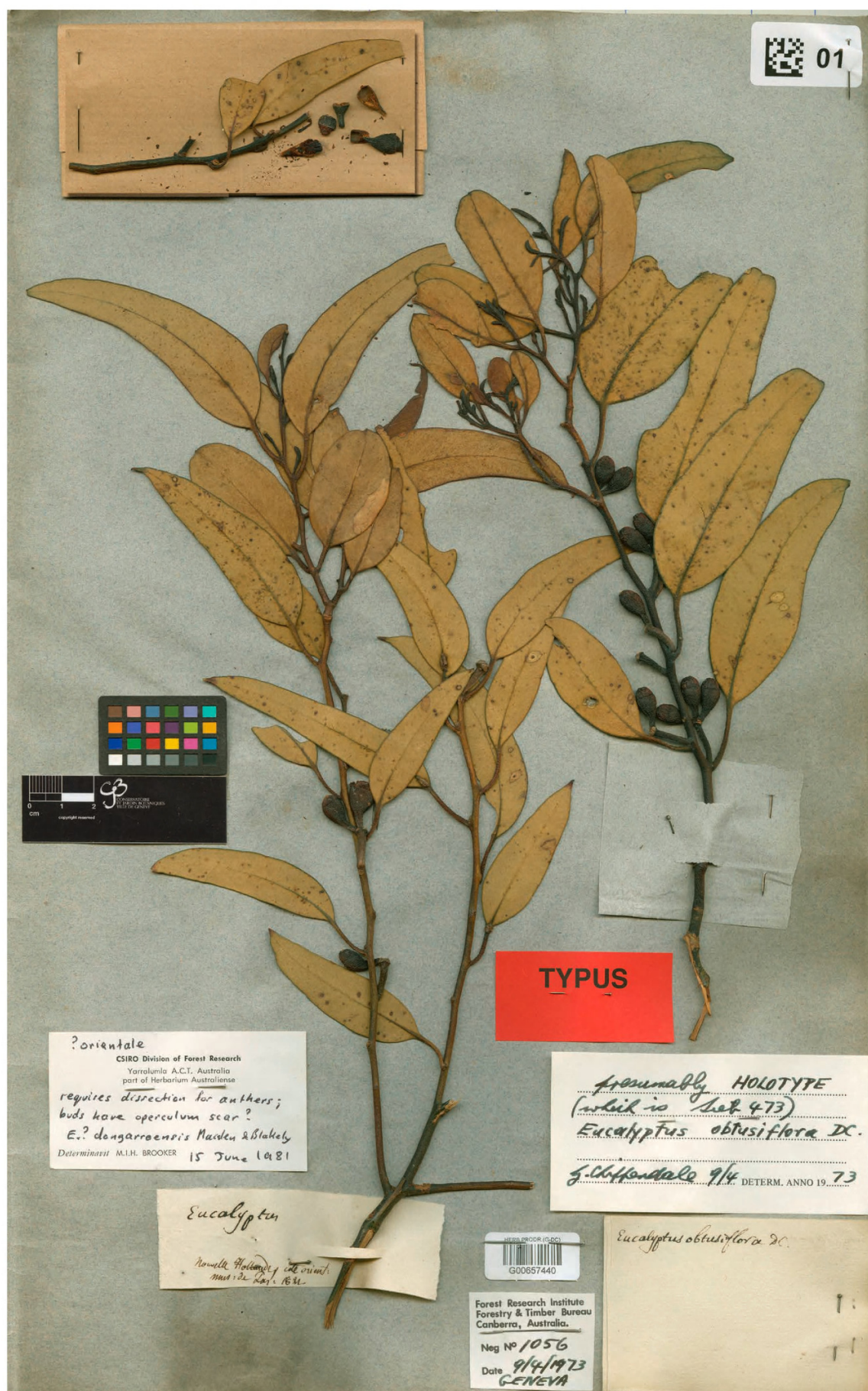
Fig. 2. The holotype of Eucalyptus obtusiflora held in G-DC (sheet G00657440). Note that the right-hand branchlet matches the plate illustrated in de Candolle's Mémoire sur la famille des Myrtacées (see Fig. 1).