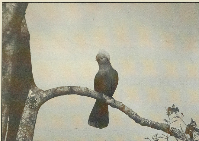
Prince Ruspoli's Turaco, 5km NW of Waddera, Sidamo Province, Ethiopia, 1996. (Alan Greensmith)